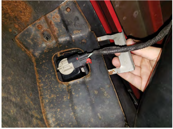
Step 1 \\ Begin by removing the metal retaining clip on license plate light. Unplug the harness, and remove the light from the vehicle.

Contents: Tools Required: (2) LED License Plate Lamps Flat Head Screw Driver