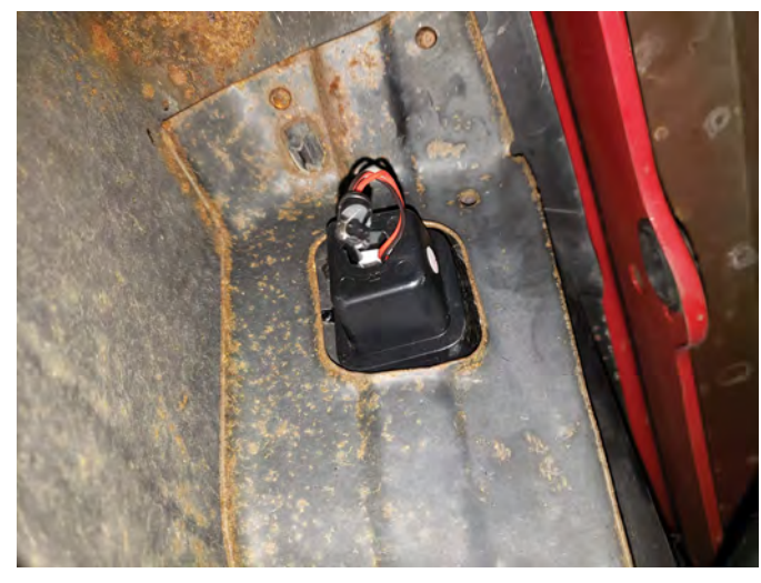
Step 2\\ Insert the new Axial light into the slot, and secure with the factory metal retaining clip.