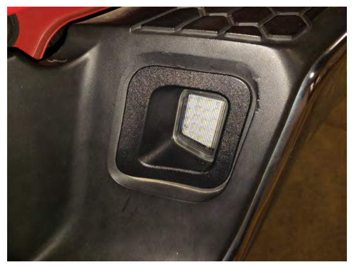
Step 4 \\ Test light for proper function.