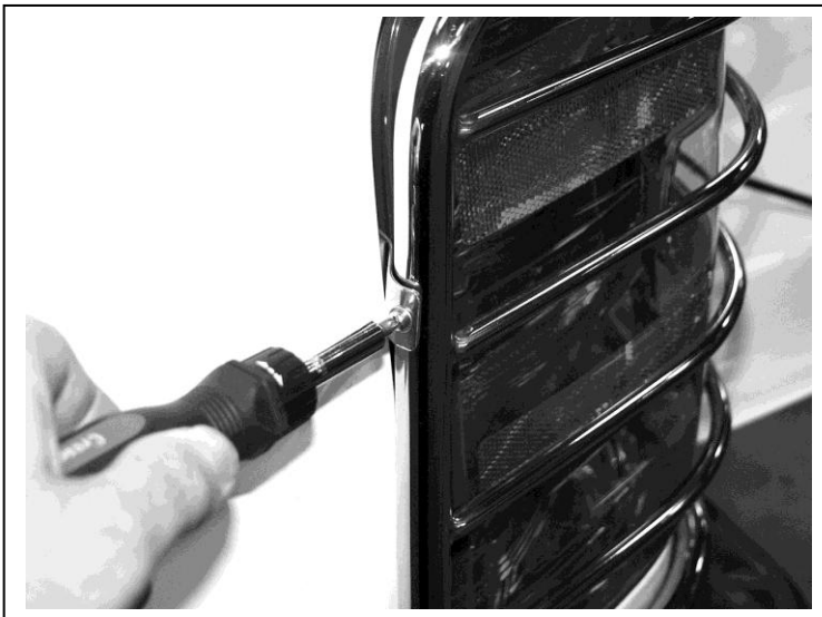
FIG. 4 4mm screw installs through front bracket into threaded insert in guard