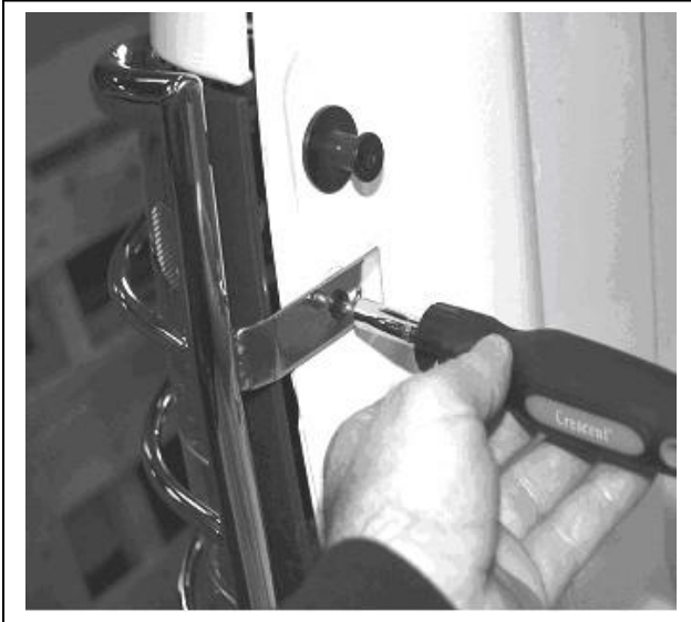
FIG. 3 Stock taillight mounting screws reinstall through inside brackets.