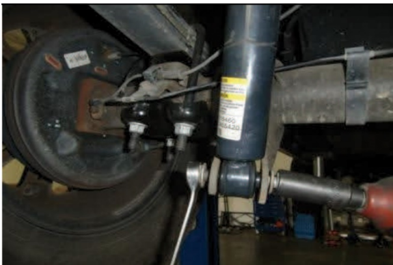
Remove lower shock bolt.