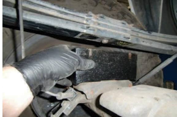
Tapered Blocks: Place block and take care that the pin is aligned with the hole in the block.