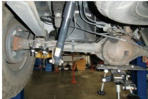
Support the rear axle with a jack.