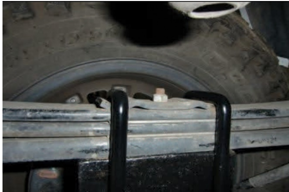
Make sure the top of the U-bolt in aligned in channels on upper plate.