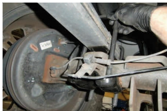
Remove U-bolt mounting hardware.