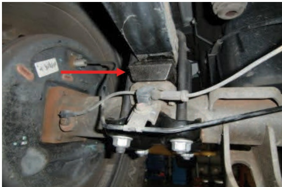
4WD models will have a factory block.