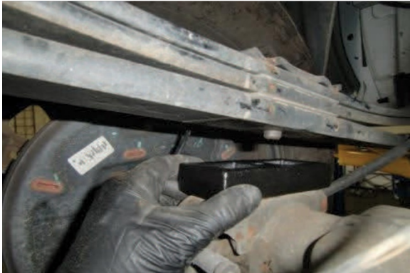
1" Blocks: Place new 1" block and take care that the pin is aligned with the hole in the block.