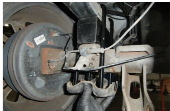
Reinstall lower plate.