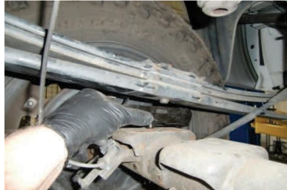
4WD Models; Remove factory block.