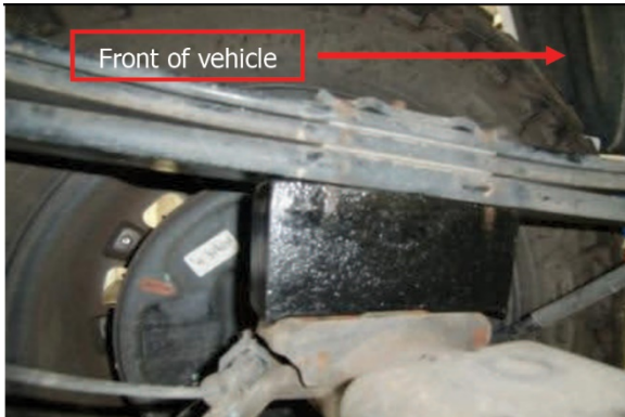
Tapered block with shorter end towards front of vehicle.