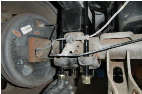
Install new, longer, U-bolts and hardware.