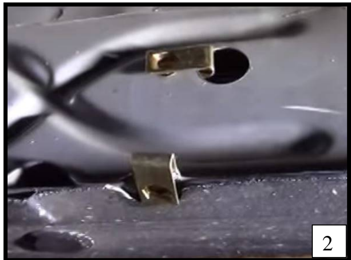
2. Insert the M8 clip nuts into the position.