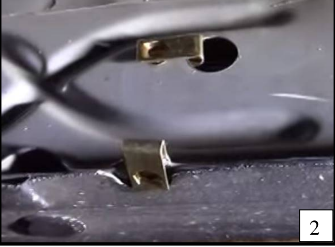
2. Insert the M8 clip nuts into the position.