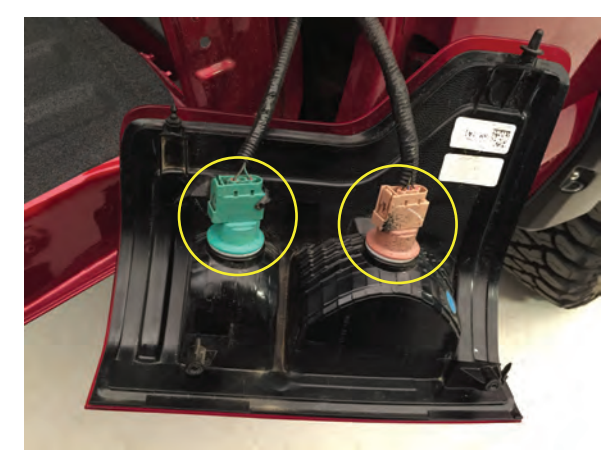
Step 3 Disconnect the factory plugs from the stock tail light.