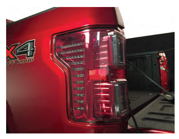
Step 5 Re-install the new tail lights in reverse order.