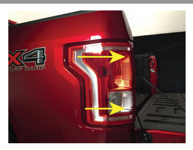
Step 2 Remove the tail light by applying firm pressure rearward.