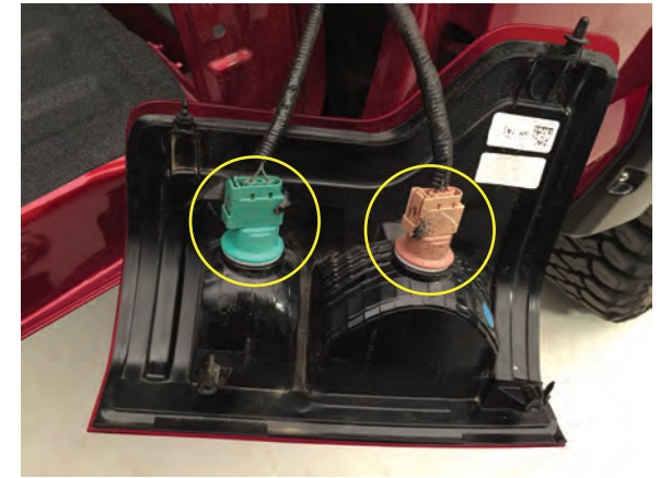
Step 3 Disconnect the factory plugs from the stock tail light.