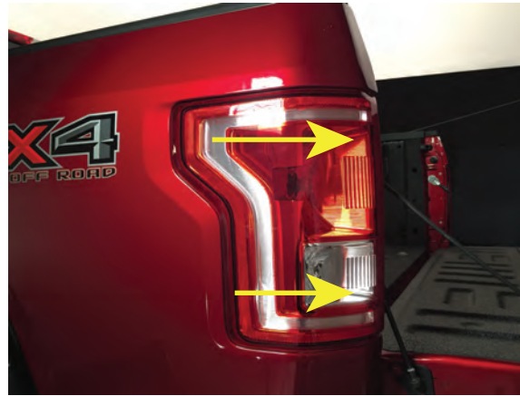
Step 2 Remove the tail light by applying firm pressure rearward.