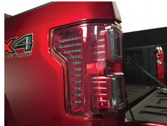
Step 5 Re-install the new tail lights in reverse order.