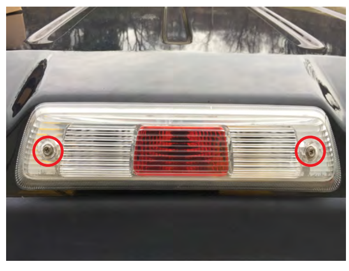
Step 1\\ Locate, and remove the (2) phillips head screws.