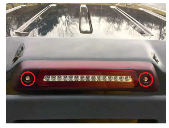
Step 4\\ Install the (2) factory screws and tighten fully.