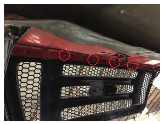
Step 2// Then remove the (4) 10mm nuts that secure the grille to the top of the hood. Carefully Remove the grille from the vehicle.