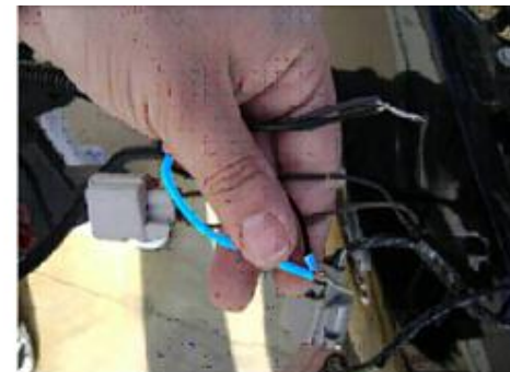
Step 14: splice the two power wires from the housing to the brown wires from the harness.