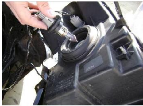
Step 7: Twist and pull the headlight bulb out of the housing.