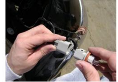
Step 11: Disconnect the side marker socket from the wire harness.