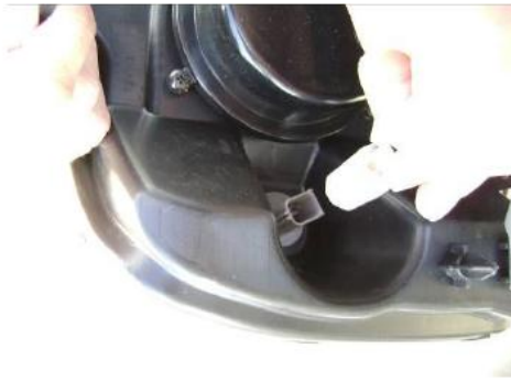
Step 16: Plug the side maker harness to the socket.