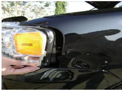
Step 19: Place the headlight assembly into the headlight housing.