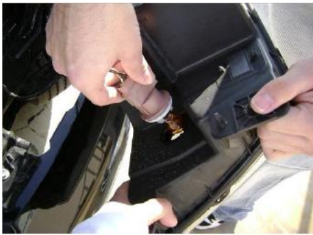
Step 6: Twist and pull the inner turn signal bulb out of the