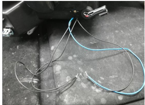
Step 12-2: twist the blue on the left and either one of the black wires on the right together(as power wires), and twist the two black wires together(as ground