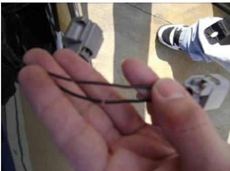
Step 13: locate the side maker light, pull back the electric tape exposing the black and brown wire on the stock harness.