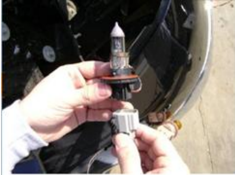
Step 9: Disconnect the headlight bulb from the wire harness.