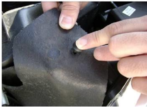
Step 21: Place the plastic clip back in place.