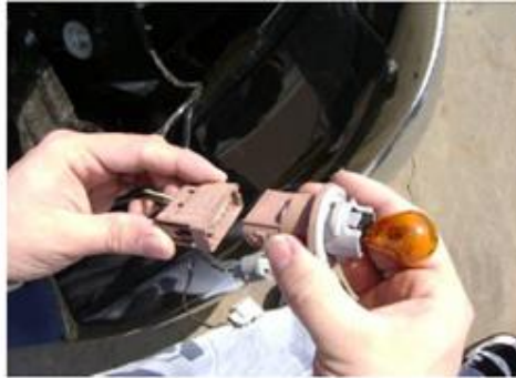
Step 10: Disconnect the inner signal bulb socket from the wire harness.