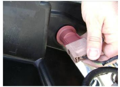
Step 17: plug the inner marker harness to the socket .