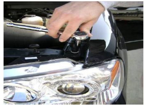
Step 20: Tighten up the three 10 mm bolts that hold the headlight to the housing.