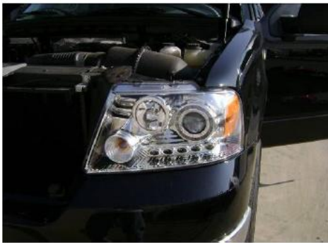
Make sure all functions are working properly before driving.