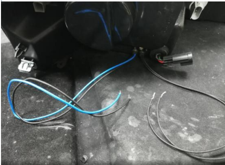
Step 12-1: there are two pairs of wires needed be spliced as shown in the picture.