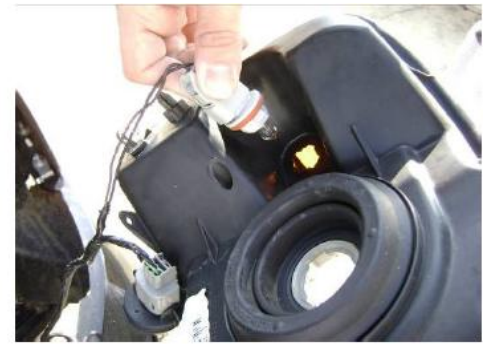
Step 8: Twist and pull the side maker light out of the headlight