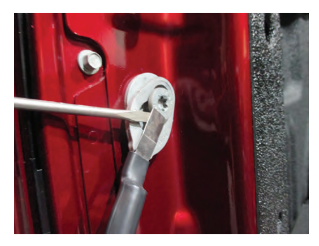
Step 1\\ Remove the lift gate strap and loosen the T50 lift gate bolt.