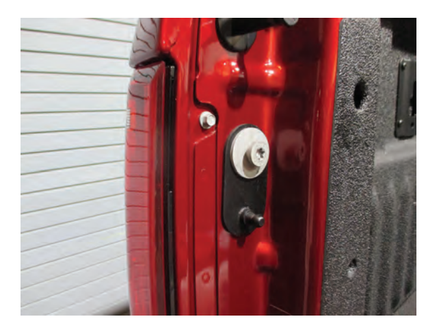
Step 2\\ Install the upper bracket behind the upper lift gate bolt. Reinstall lift gate strap.