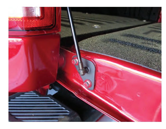
Step 4\\ Install the lower ball mount plate, reuse the factory bolts.