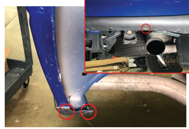
//Step 4 (Rear):

**Note: The metal clips are very tight by design.