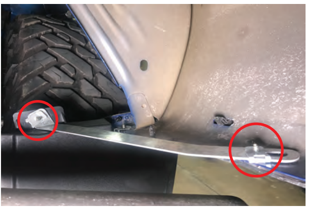
//Step 6: Using provided bracket, install the supplied screw clips to the bracket. Using provided Phillips head screws, attach bracket to vehicle as shown. Repeat procedure to install mud guards to opposite side of vehicle.