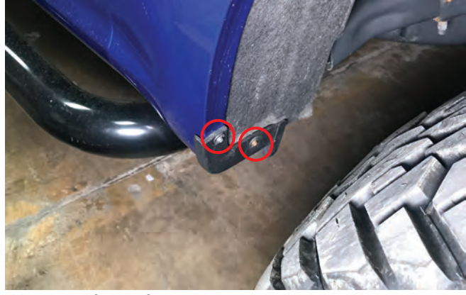
// Step 1 (Front):

Remove the (3) push clips. (2) clips are in the wheel well, while (1) clip is under the bed. Do not remove the plastic panel from the vehicle.