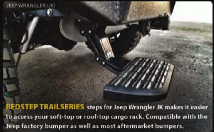
JEEP WRANGLER (JK)

FLIP DOWN. STEP UP. Bolts-up to the frame on the driver-side using the factory bumper mounting points. BedStep provides an easy step up into the truck bed – even with the tailgate open or closed.