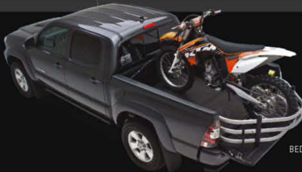
BEDXTENDER HD MOTO