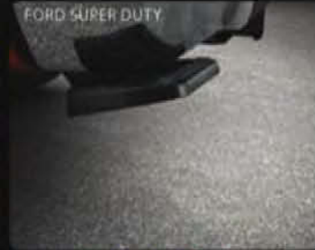
FORD SUPER DUTY