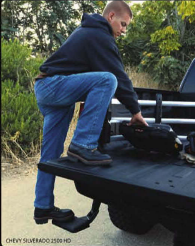
CHEVY SILVERADO 2500 HD