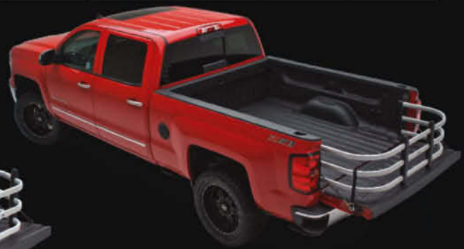
BEDXTENDER HD SPORT