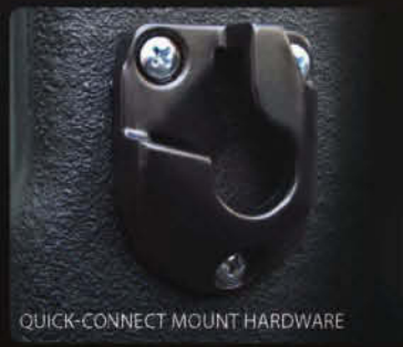
QUICK-CONNECT MOUNT HARDWARE