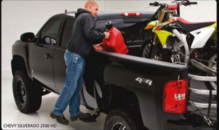
CHEVY SILVERADO 2500 HD