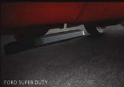
FORD SUPER DUTY

BEDSTEP2™ gives you a leg up right where you need it most. Mount it on either side of the truck bed, just behind the cab, to get easy access to tools, supplies or 5th-wheel hitch.