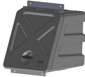
Gear Pod (QTY.1)