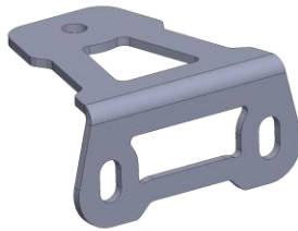
Light Bracket (QTY.2)