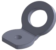
Tie Down Ring (QTY.2)