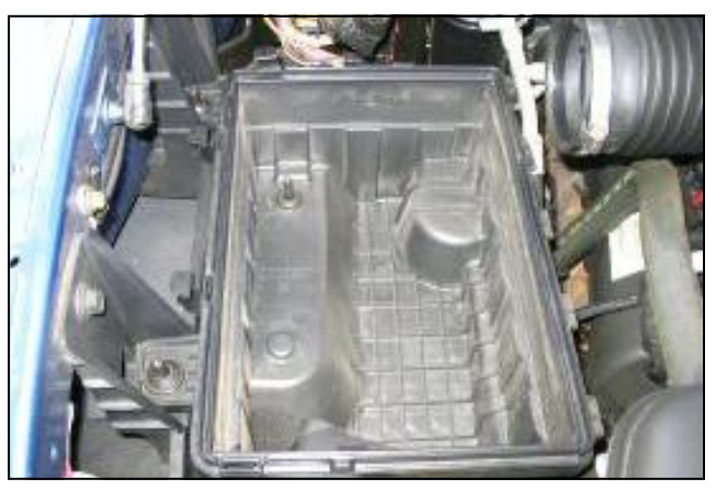
3. Unsnap and remove the factory air box lid, tube, & factory air filter.