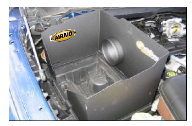
10. Position the Airaid Cool Air Dam in place of the original air box lid. Snap in place.