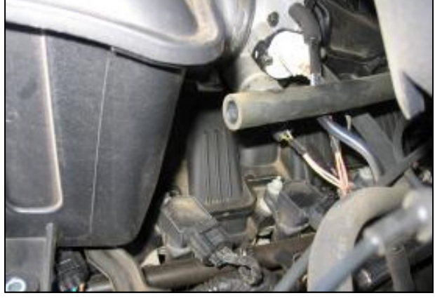
5. <u>2002 & 2003 Models Only:</u> Disconnect the crankcase vent hose on the back of the factory throttle body air chamber.