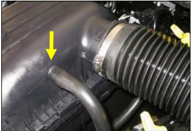
2. <u> 2004-05 Models Only: </u> Disconnect the factory breather hose from the factory air box lid.