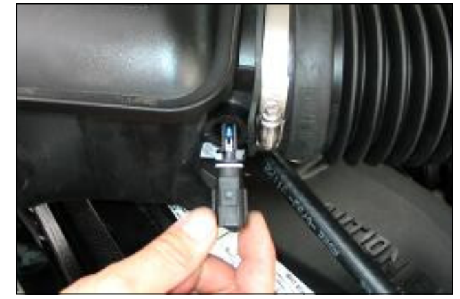
6. <u>2003-05 Models Only:</u> Disconnect air temperature sensor wire on back of factory throttle body air chamber and remove sensor. Retain sensor for later use with the Airaid Intake System.