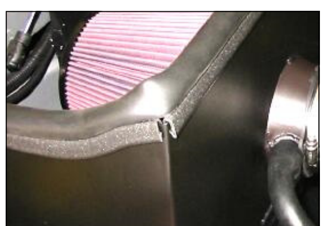
18. <u>2004-05 Models Only:</u> Connect the factory breather hose to the Airaid Cool Air Dam & secure using the #24 Speed clamp provided.

19. Double check your work to be certain that all nuts, bolts, and clamps are securely fastened.