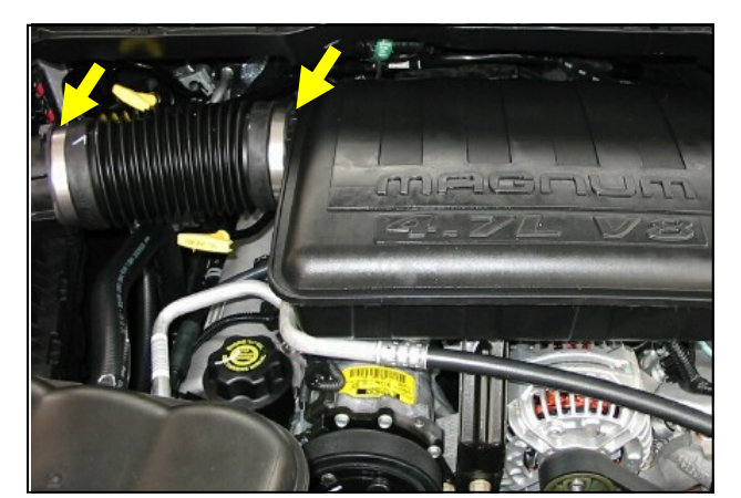
1.Disconnect The Negative Battery Terminal! Loosen the two hose clamps on the factory air tube.