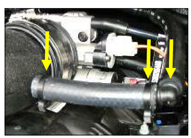
15. <u>2002 & 2003 Models Only:</u> Use the 90° plastic elbow provided, connect the factory breather hose with the 4 ½" hose to the Airaid tube & secure using the three #16 black Speed clamps.