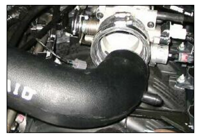
13. Position Airaid tube into place by connecting hump hose to Airaid Cool Air Dam and connect the other end of the tube to the factory throttle body coupler. Utilize the #60 hose clamps on the hump hose and #56 hose clamp on the factory coupler.