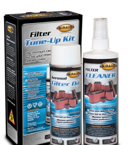
P/N 790-551 Aerosol Spray P/N 790-550 Squeeze Spray

For your Oiled media filter we suggest using the AIRAID Filter Tune-Up Kit!