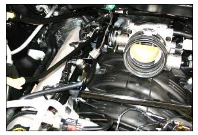
7. Unsnap the factory intake assembly from front of bracket and remove assembly from vehicle. (Note: leave the factory coupler on the throttle body)