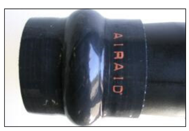
12. Install urethane hump hose onto the Airaid tube and secure using a # 60 hose clamp provided.