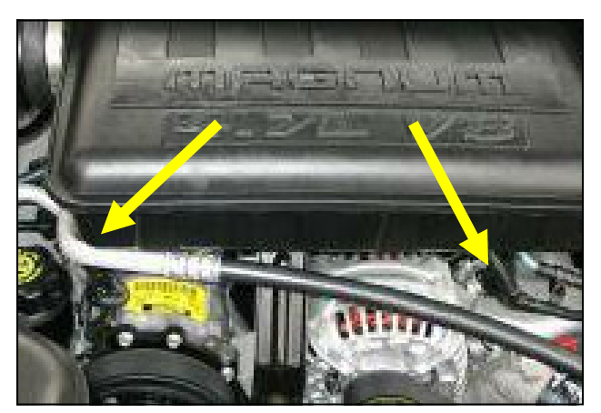
4. Loosen and remove the two 10mm bolts holding on the factory throttle body air chamber intake assembly.