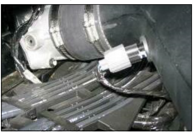
14. Re-connect air temperature sensor connector to the sensor in the Airaid tube.