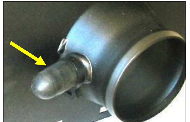
17. <u>2002 & 2003 Models Only:</u> Slip the black rubber cap over the nipple on the Cool Air Dam and secure using the #19 Speed clamp provided.