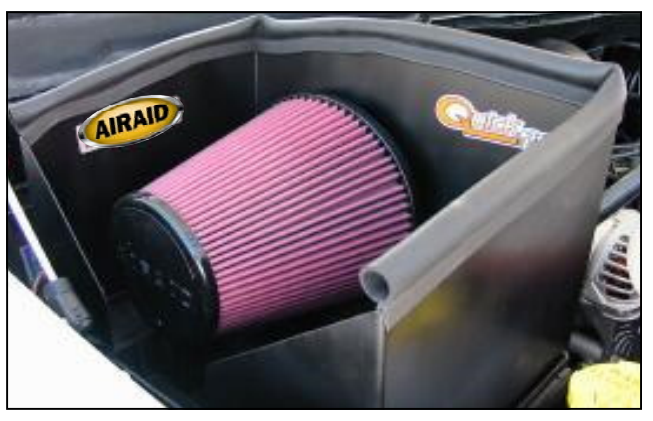
11. Mount the Airaid Premium filter inside the Cool Air Dam & secure with hose clamp provided. In addition, install the weather strip hood seal on the Cool Air Dam. (Hint: begin in a corner and work it on toward the ends)