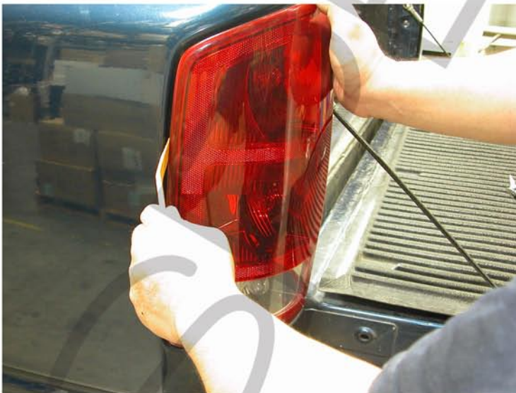
3. Remove the taillight