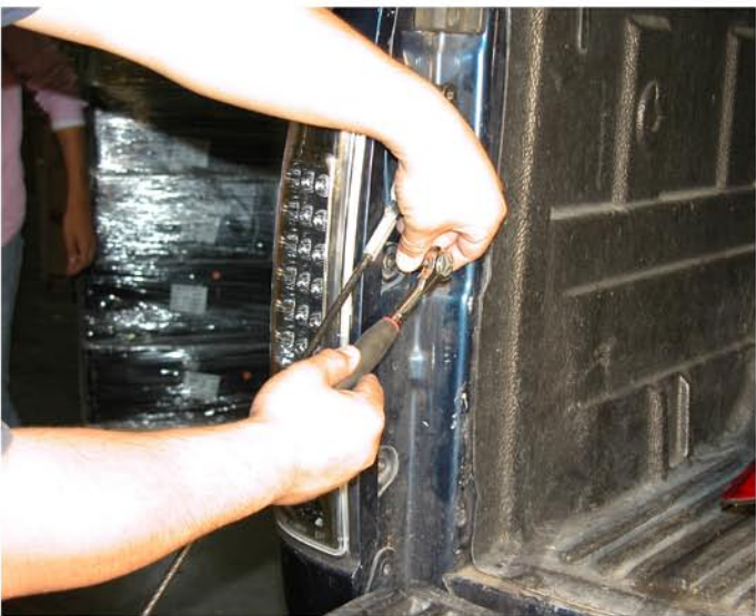
7. Install two T20 bolts