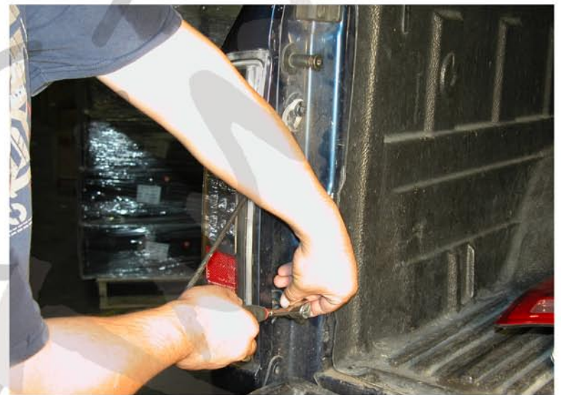
8. Please repeat the picture order from 1 to 8 for the opposite side