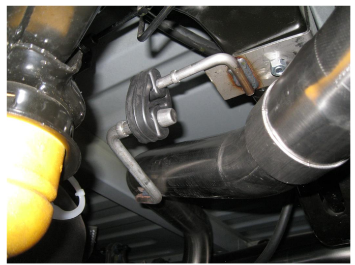
Step 5. Install both Tail Pipe Assemblies in a similar fashion. Use the supplied rubber Insulator to locate the drivers side welded hanger.

Step 4. Install the supplied hanger assembly using a pre drilled hole in the drivers side sub frame and the supplied hardware. This will be used with the supplied rubber insulator to locate the new drivers side Mid Pipe Assembly hanger. Slip the inlet of both Mid Pipes over the outlet of the Muffler Assembly and loosely secure using the supplied 2.50" clamp and 15mm socket. Engage all welded hangers to the OEM rubber insulators.