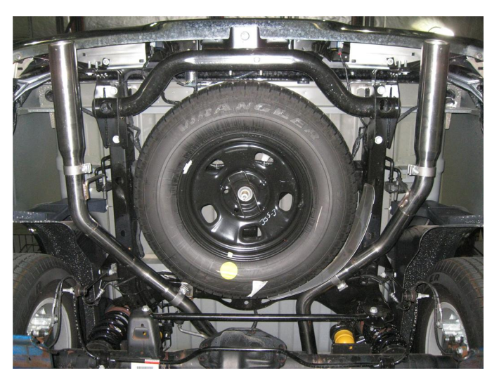
Step 6. Loosely attach the polished tips using the supplied 2.50" clamps to the desired position.