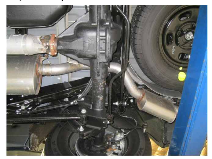
Step 2. Unbolt the clamp just behind the muffler. Do not damage or discard the OEM fasteners or rubber insulators, as they will be reused to mount the new system. Disengage all hangers and remove the OEM system from the vehicle.