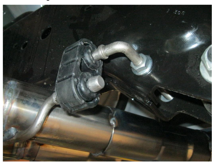
Step 4. To support the Tail Pipe Assembly you will need to locate the supplied threaded hanger through two exsisting holes in the vehicles sub frame. Secure with the supplied hardware as shown.