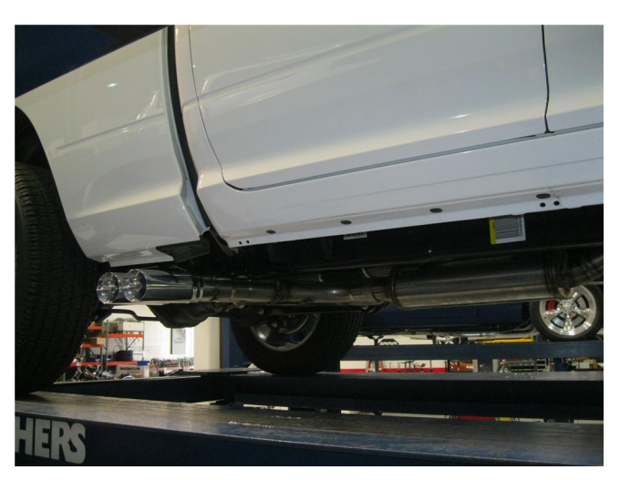
Step 6. Once a final position has been chosen for the new exhaust system, evenly tighten all clamps from front to rear using the torque specifications on page one of the instructions. Inspect all fasteners after 25-50 miles of operation and re-tighten if necessary.