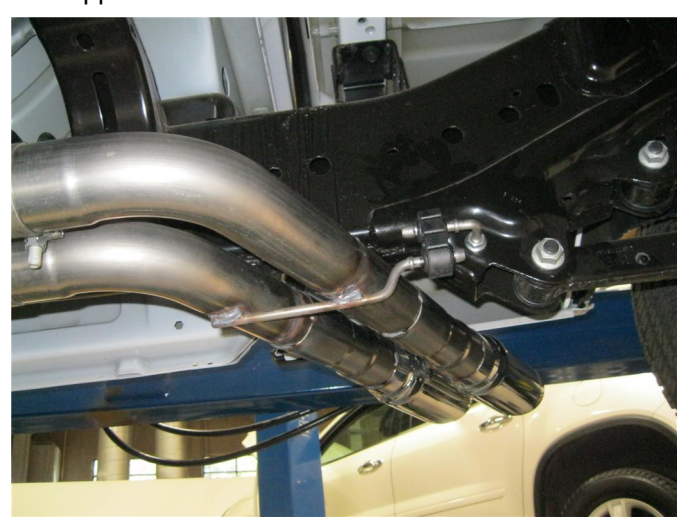
Step 5. Next, install the Tail Pipe Assembly by slipping the inlets over the Muffler Assembly outlet pipes. Loosely secure with the supplied clamps. Locate the supplied rubber isolator to the previously mounted hanger and the welded hanger on the assembly.