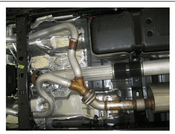
Step 1. To remove the OEM exhaust system, you will first need to unbolt the muffler assembly from the Y-Pipe assembly.