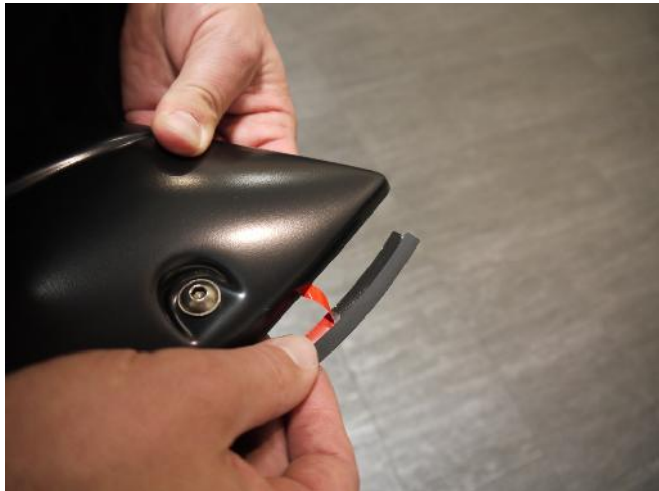
STEP 2: Attach the included rubber seal to the Fender Flares. Peel back 2" of the adhesive backing and position on the Fender Flare. Attach the seal to the Fender Flare, peeling back a few inches at a time. Attach rubber seal along all areas the Fender Flare will make contact with the vehicle body.

For Technical Support/Warranty Information please call 310-762-9944