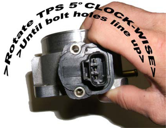
Rotate TPS to align bolt holes