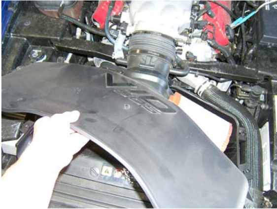
Remove air box lid