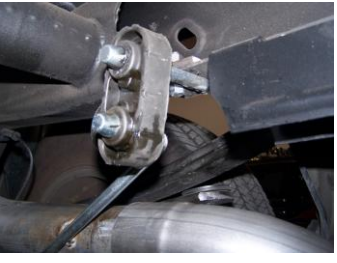
5. Next, remove your spare tire. Then install passenger side tailpipe hanger #I. You will see a 11/2" hole in the frame. Attach hanger to this hole and re-install factory grommet on hanger.

6. Slide passenger side tailpipe #C into muffler 1.5-2". Use clamp #H to secure. Do not tighten. Insert welded hangers into rubber grommets.