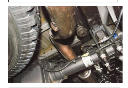
6. With proper clearance from spare tire install the exhaust tip onto the tailpipe. The system was designed to have the tip 1" below the quarter panel of the vehicle. With the tip in your desired position begin to tighten down all clamp connections from the front head pipe back.