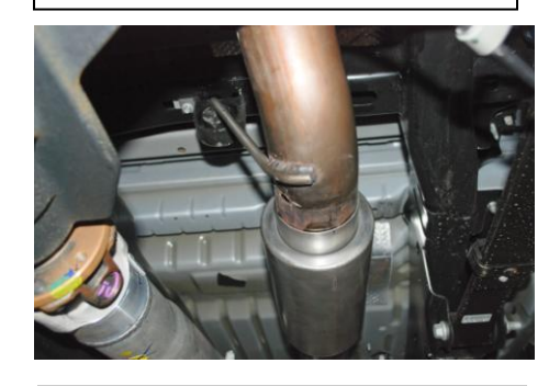
5. With everything loose you may need to adjust the system for proper clearance of shocks, brake lines, ect.