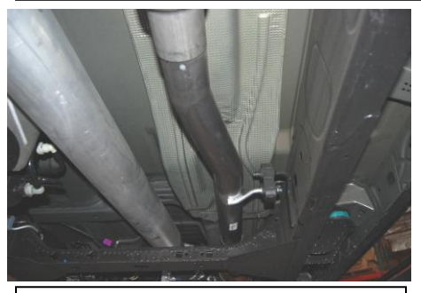
2. Install Head pipe Item # A onto the factory flange. You will re use the factory clamp at this connection. Install hanger into rubber grommet and loosely tighten down the clamp.

1. Disconnect the negative battery cable before removal of the OEM Exhaust. This will allow the computer to reset and recognize the new exhaust. Lay out the exhaust on the floor so it looks like the drawing and compare parts with manual. Remove the factory exhaust by cutting behind the factory muffler. Once the tail pipe has been removed un-bolt the muffler and head pipe at the flange located behind the catalytic converter. Use wd-40 or another type of penetrating oil to remove the rubber grommets. Do not damage these they will be re used.