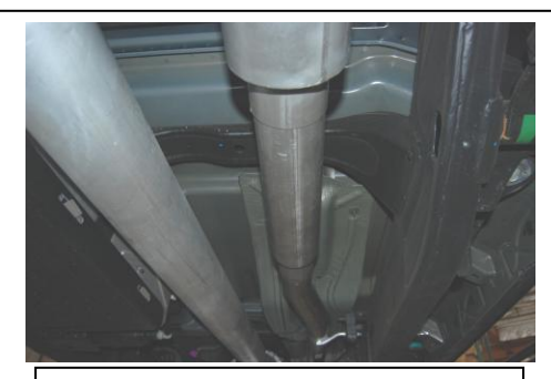
3. Install muffler assembly Item # B onto the head pipe. You may need to use a jack stand to support the muffler while installing the tailpipe. Use Item# E to clamp the muffler assembly to the head pipe. Loosely tighten down.