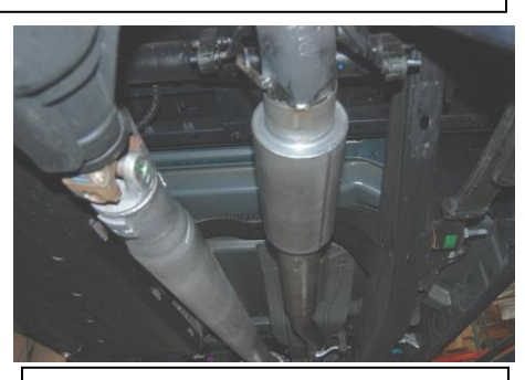
4. Install over axle pipe Item # C into the muffler outlet. Slip the hangers into the rubber grommets and keep tailpipe loose.