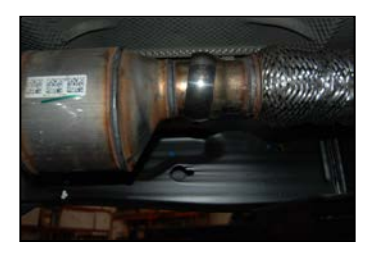
2. To remove stock exhaust, unclamp it at the ball connection behind the Y-pipe. Make sure to leave all rubber grommets in the factory location. You will re-use stock clamp. For easier removal of exhaust, cut behind the muffler. Use WD-40 to remove hangers from

1. Disconnect the negative battery cable before removal of OEM exhaust. This will allow the computer to reset and recognize the new exhaust. Lay out the exhaust on the floor so it looks like the drawing and compare parts with manual.