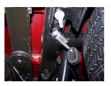
5. Install metal hanger #H into hole located approximately 16" from the rear of the frame. Use hardware kit #I, washer #M, and rubber grommet #J.

4. Install muffler #B with inlet towards Y-pipe. Use jack stands to support the muffler. Use clamp #F to secure the muffler to headpipe. Do not tighten.