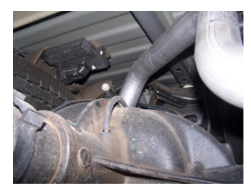
6. Install driver side tailpipe #D into muffler at least 1.5" to 2". This pipe will route over the axle and between the shock and spare tire. Use clamp #G to secure pipe to muffler. Do not tighten. Insert welded hangers into rubber grommet.