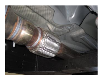
unclamp it at the ball flange behind the Y-pipe. Make sure to leave all rubber grommets in the factory location. You will re-use stock clamp. For easier removal of exhaust, cut behind the muffler. Use WD-40 to remove hangers from grommets.

1. Disconnect the negative battery cable before removal of OEM exhaust. This will allow the computer to reset and recognize the new exhaust. Lay out the exhaust on the floor so it looks like the drawing and compare parts with manual.