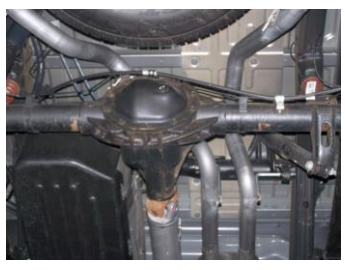
5. Install metal hanger #H into hole located approximately 16" from the rear of the frame. Use hardware kit #I, washer #M, and rubber grommet #J.

pipe. Use jack stands to support the muffler. Use clamp #F to secure the muffler to headpipe. Do not tighten.