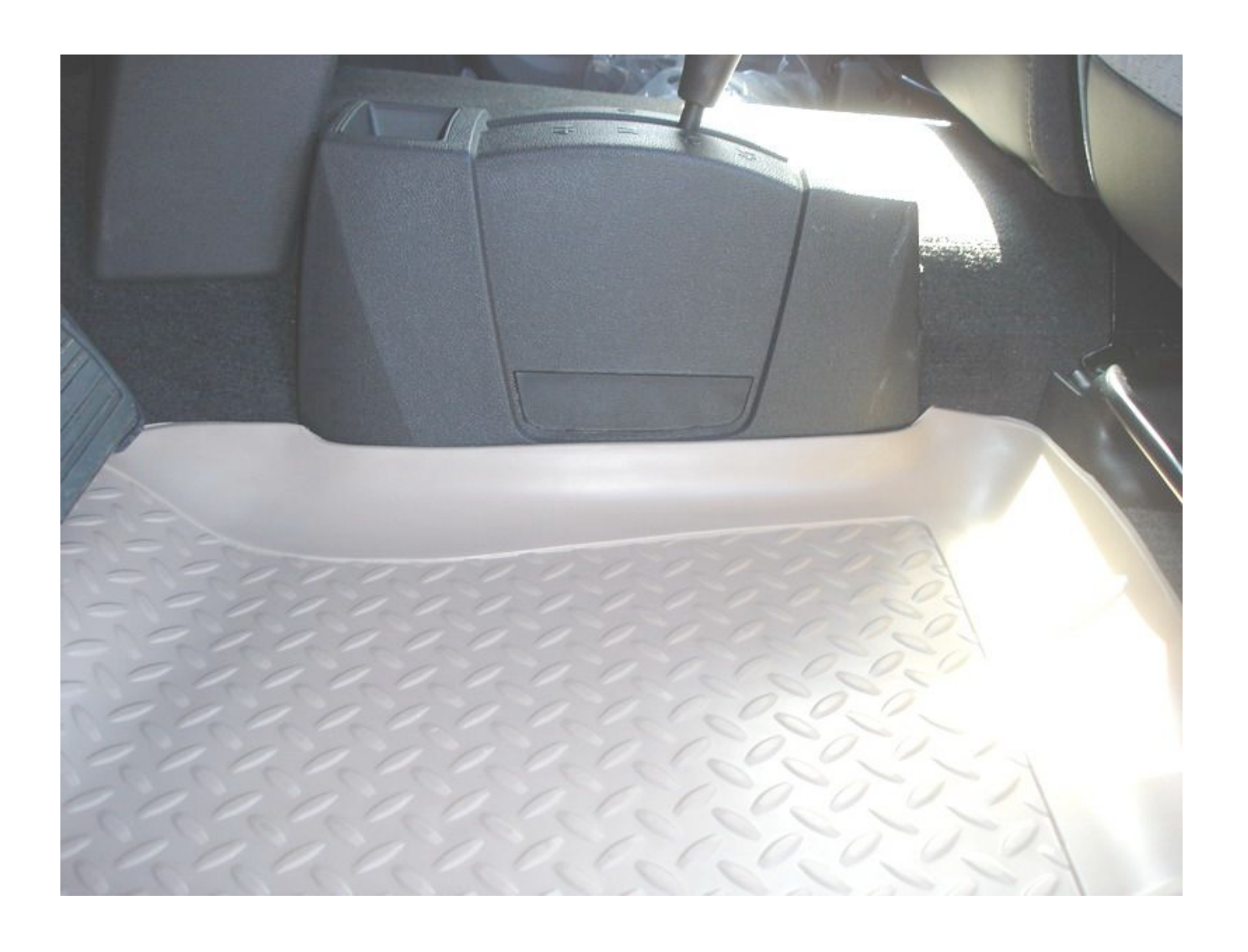
PHOTO SHOWING PART #3135 TRIMMED FOR A MANUAL TRANSFER CASE SHIFTER.