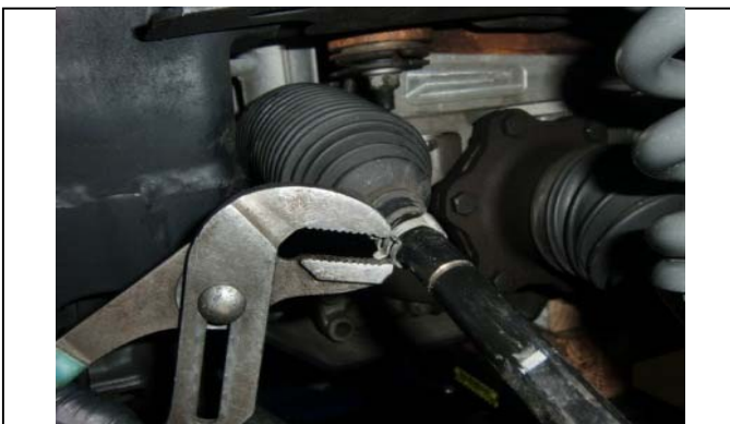
Remove spring clip on inner tie rod