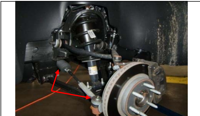
Photo shows inner/outer tie rod assembly