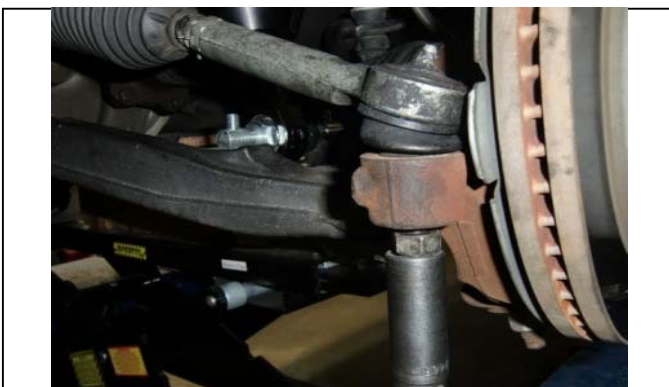
Remove outer tie rod nut at spindle