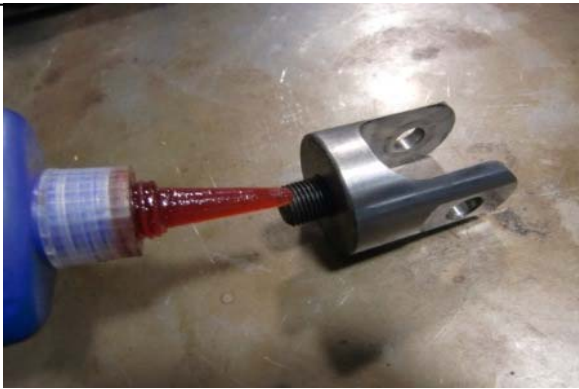
Note: Use thread locking compound on clevis mounting bolt