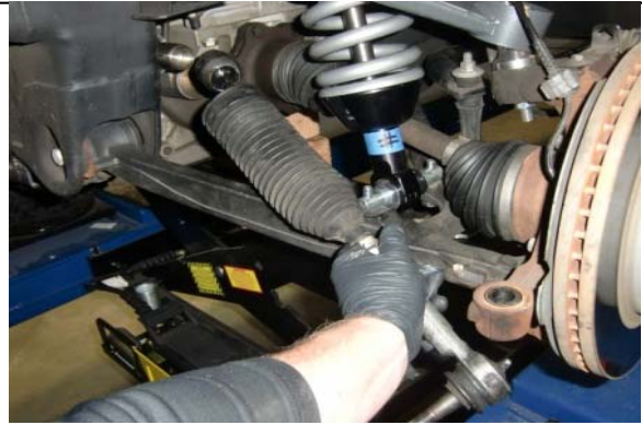
Remove entire inner/outer tie rod assembly.