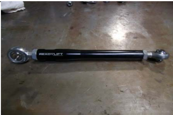
Picture of assembled steering assembly