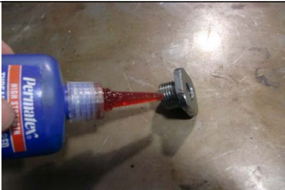
Note: Vehicles requiring rack adapters, use thread locker