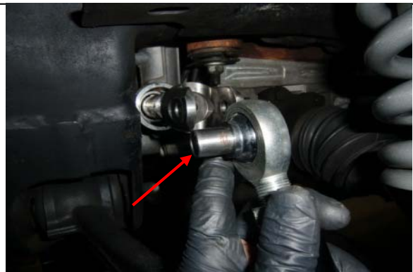
Insert reducer sleeve into sm. heim end and insert into clevis