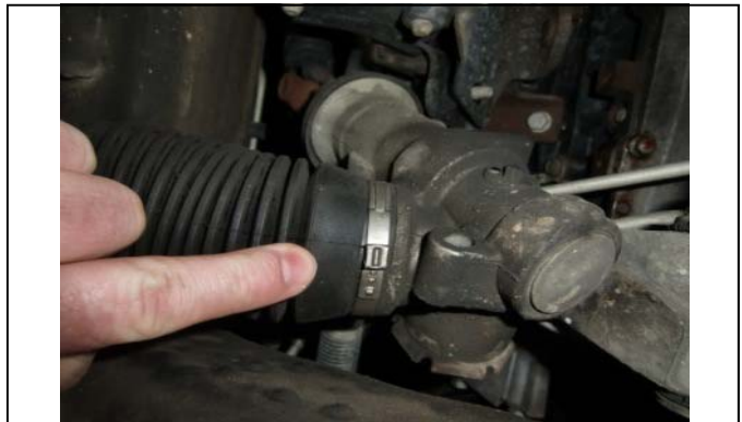
Cut remove metal clamp from steering rack