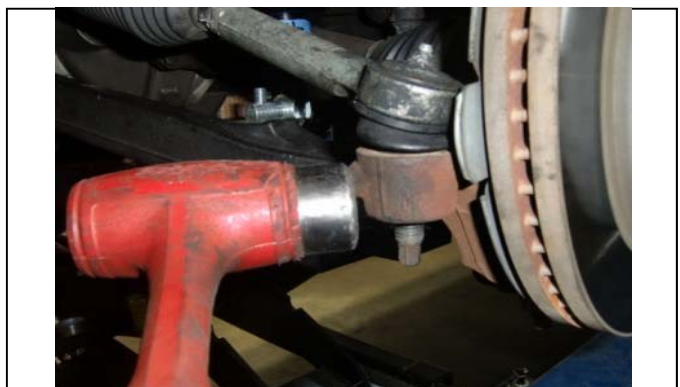
Strike with hammer to disconnect joint from spindle