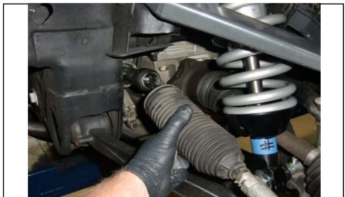
Slide boot off steering rack to expose inner tie rod socket