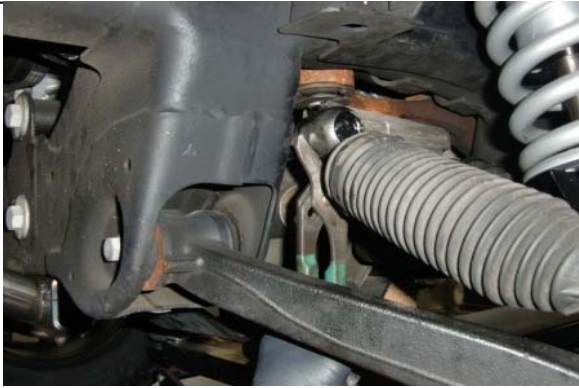
Loosen inner tie rod socket at the steering rack.