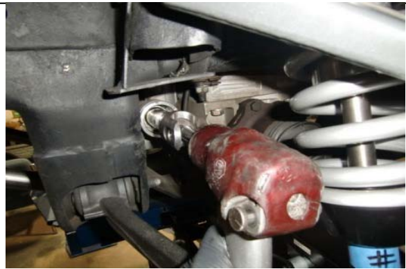
Tighten to spec with clevis positioned as shown, (vertical)