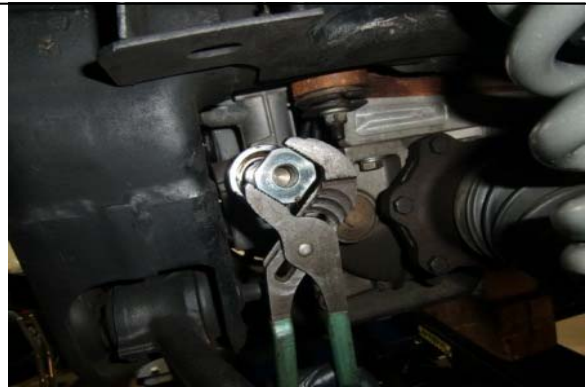
Clean rack threads and install & torque steering rack adapter.