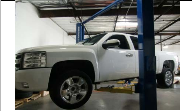
Securely lift front of vehicle and support frame