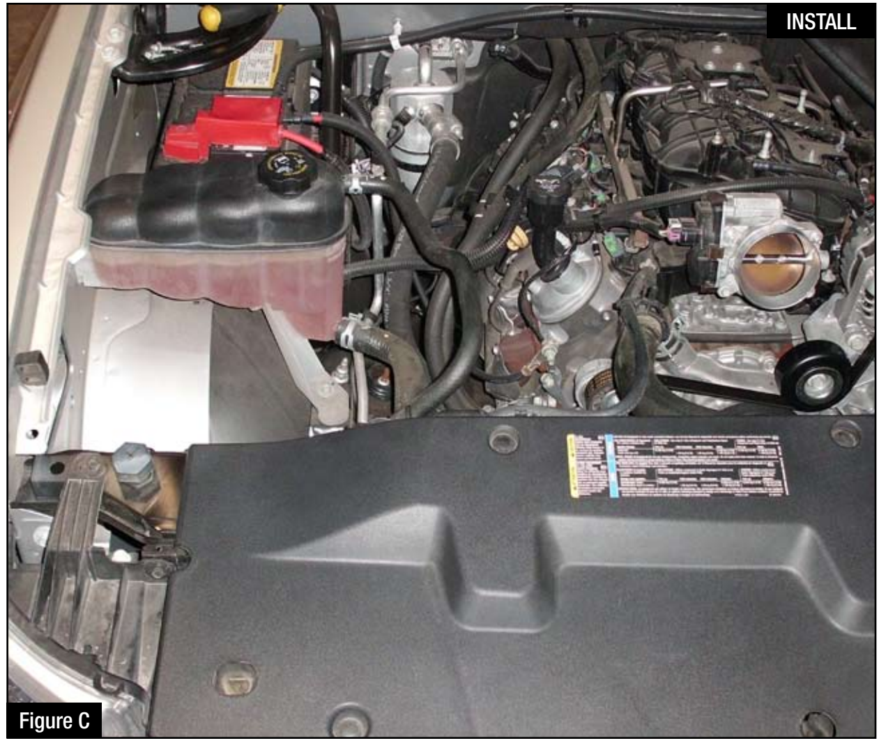
Refer to Figure C for step 7

Step 7. Remove stock intake tube from vehicle.