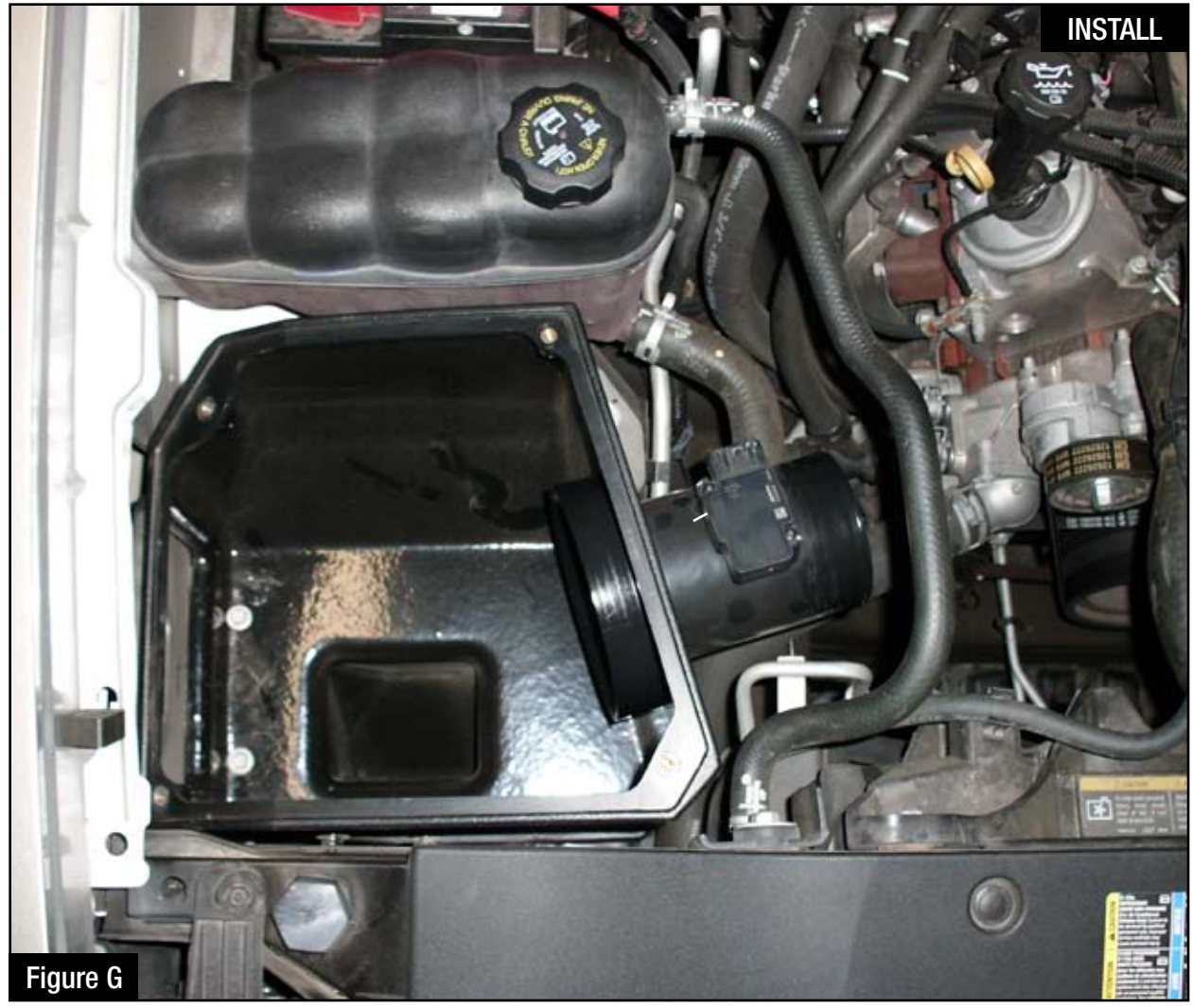
Refer to Figure G for step 14

Step 14. Using the stock 4 mounting bracket bolts fasten the aFe housing to the chassis.