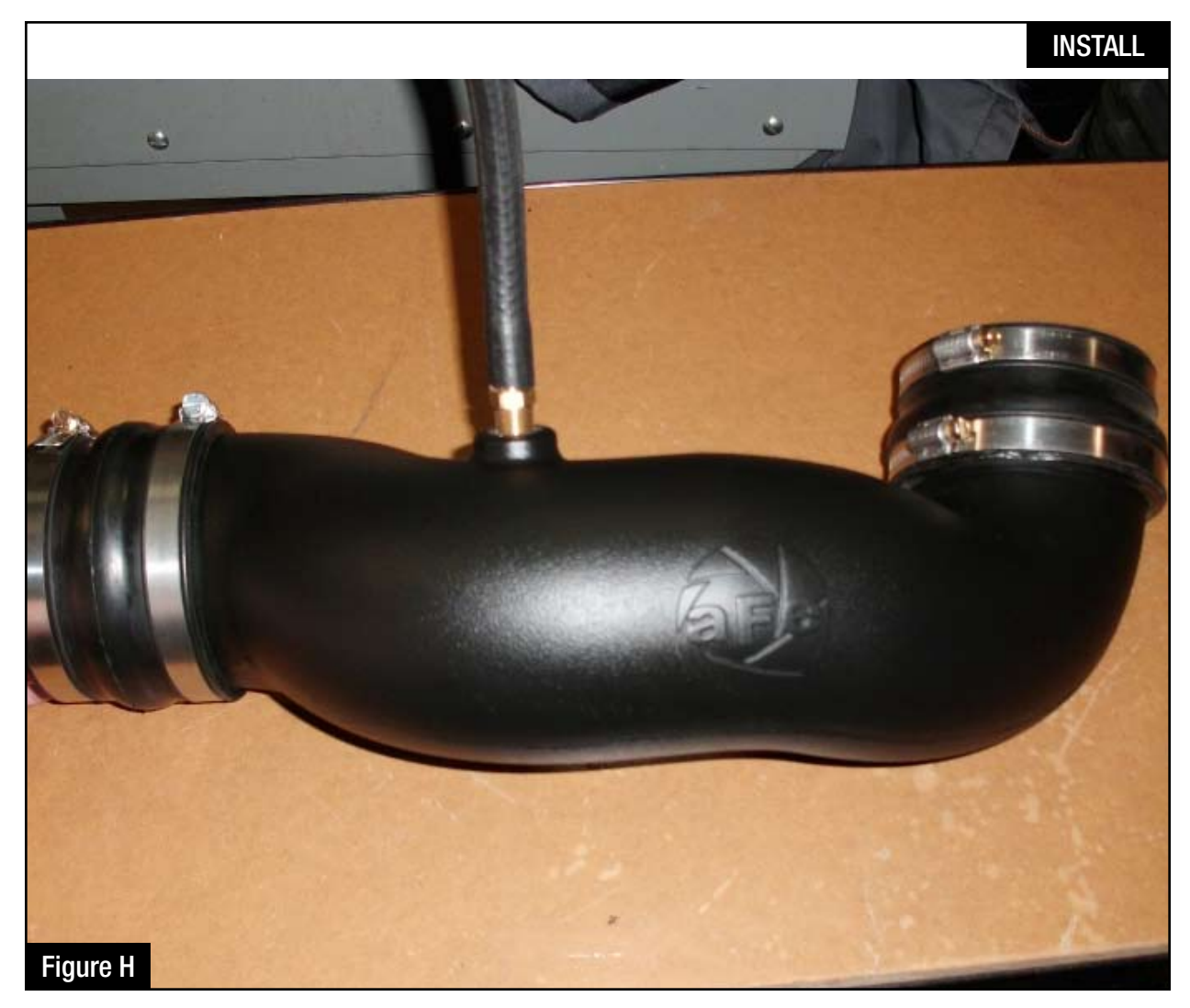
Refer to Figure H for step 15

Step 15. Install supplied couplers, clamps, brass fitting, and breather hose to the aFe intake tube. (Do not tighten clamps.)