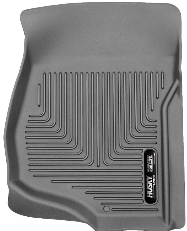
RIGHT OR PASSENGER