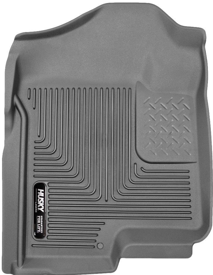
LEFT OR DRIVER

Your liners are made from an engineering resin that is lightweight and extremely tough and durable. The easiest way to clean your liners is with a damp cloth or sponge and soap and water. Windex®, 409® and ArmorAll® type cleaners work as well.