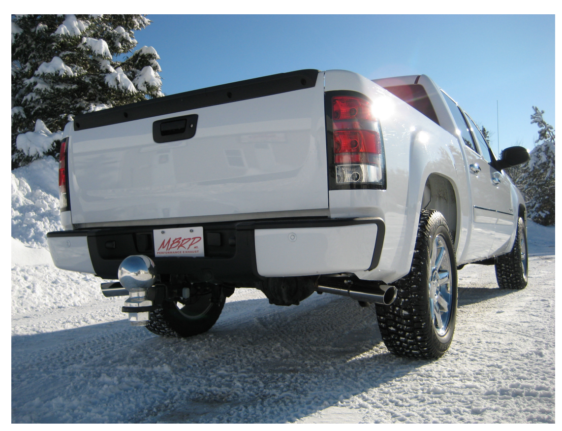
Congratulations! You are ready to begin experiencing the improved power, sound and driving excitement of your MBRP Inc. performance exhaust system. We know you will enjoy your purchase.