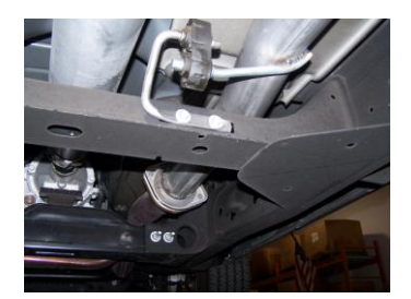
3. Install headpipe #A onto your existing stock flange and secure using the stock hardware. Do not tighten. Insert welded hanger into rubber grommet.

5. Slide tailpipe #C into muffler 1½"-2" and secure with clamp #F. Do not tighten. Insert welded hangers into rubber grommets.