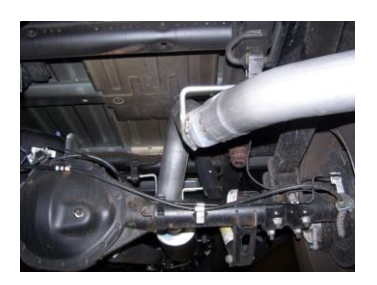
7. Slide exit pipe #D over tailpipe and secure with clamp #F. Do not tighten. Rotate exit pipe to best suit your vehicle.