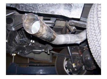
6. Slide passenger side tailpipe #C into muffler 1.5-2". Use clamp #H to secure. Do not tighten. Insert welded hangers into rubber grommets.

10. If you haven't done so already ... Install stainless steel tips. Clamp down. When you have everything in place, firmly tighten all bolts and clamps down securely. Use stainless steel or aluminum cleaner to polish tips. Inspect all fasteners after 25-50 miles of operation and re-tighten as necessary.