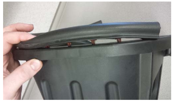
6. Clean off the fender well, then attach the inlet seal (P/N: 2414-9F673) as shown.