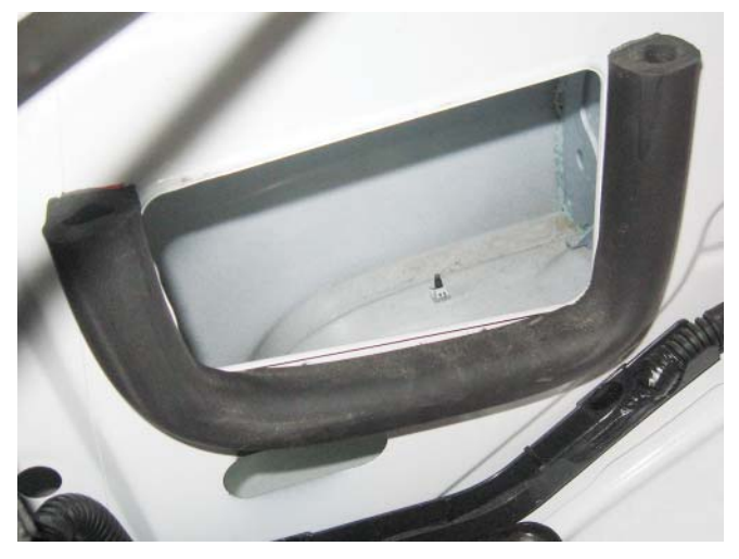
7. Insert the air box assembly into the truck, push down to seat the posts into the grommets.