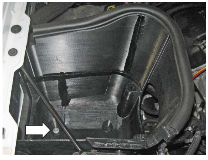
8. Thread and tighten the provided M6 bolt (P/N: N605891) into the bottom of the air box. Tighten to 10 Nm.