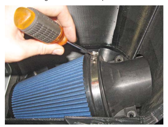
11. Install the MAF sensor into the filter tube. Torque the screws to 2 Nm.