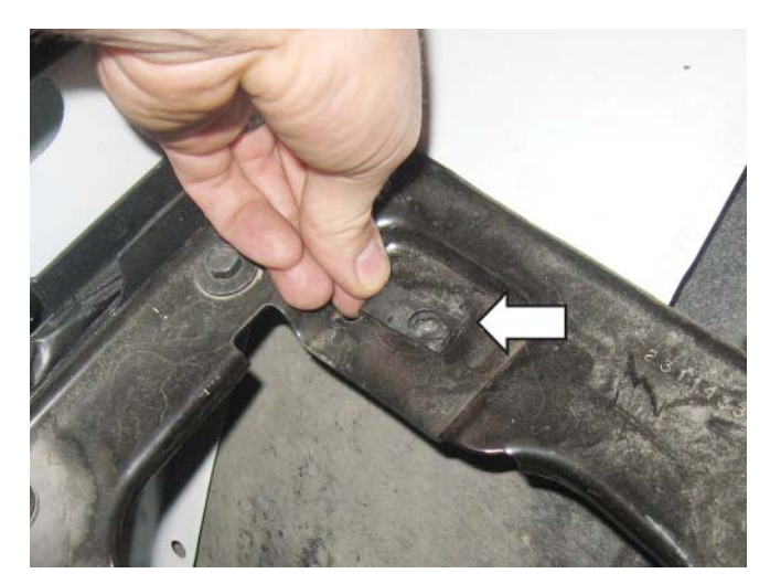
4. Install the grommet (P/N: 9600K53) into the air box tray as shown.