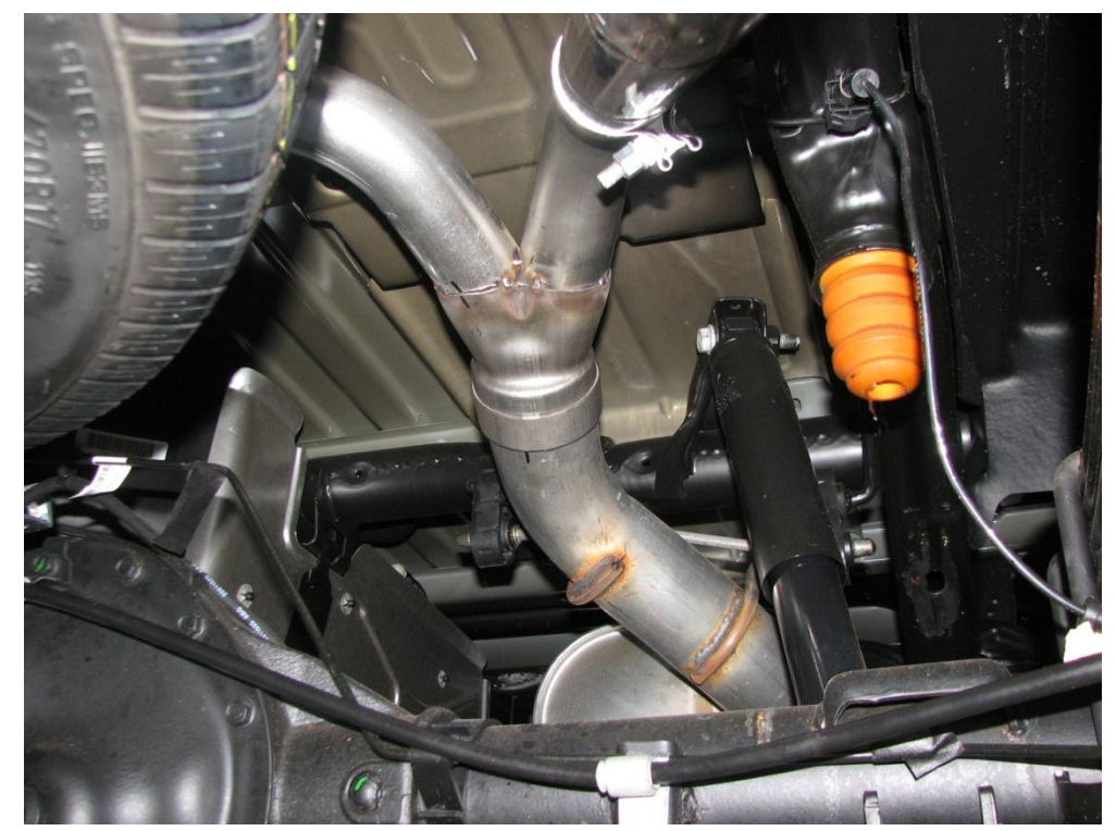
Figure 2: Installation of 'Y-pipe'

Next bolt the supplied clamp hanger onto the round frame rail to the left of the spare tire. Install the supplied rubber isolator onto the hanger. See figure 3.