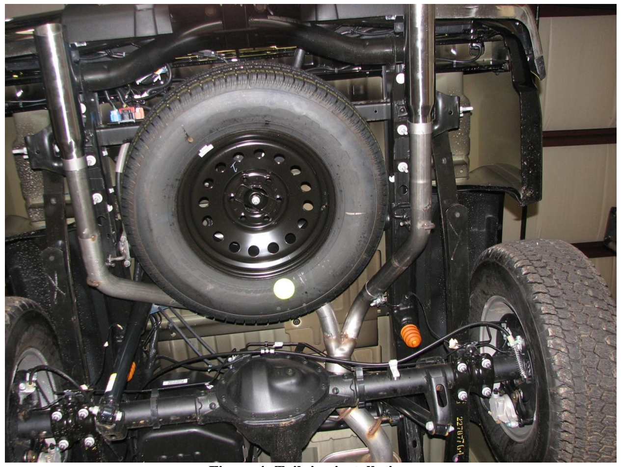
Figure 4: Tailpipe installation