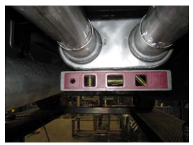
4. Install muffler #B with inlet towards Y-pipe. Use jack stands to support the muffler. Use clamp #F to secure the muffler to headpipe. Do not tighten. Muffler outlets will be level

both tailpipes to the outlets of the muffler. Rotate tailpipes to