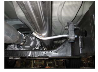
Next, install headpipe #A into the factory pipe. Insert welded hanger into the rubber grommet. Do not tighten

5. Make sure muffler outlets are level before installing tailpipes. Now install passenger tailpipe #C. Insert welded hangers into rubber grommets.