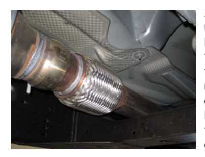
2. To remove stock exhaust, unclamp it at the ball flange behind the Y-pipe. Make sure to leave all rubber grommets in the factory location. You will re-use stock clamp. For easier removal of exhaust, cut behind the muffler. Use WD-40 to remove hangers from grommets.

1. Disconnect the negative battery cable before removal of OEM exhaust. This will allow the computer to reset and recognize the new exhaust. Lay out the exhaust on the floor so it looks like the drawing and compare parts with manual.