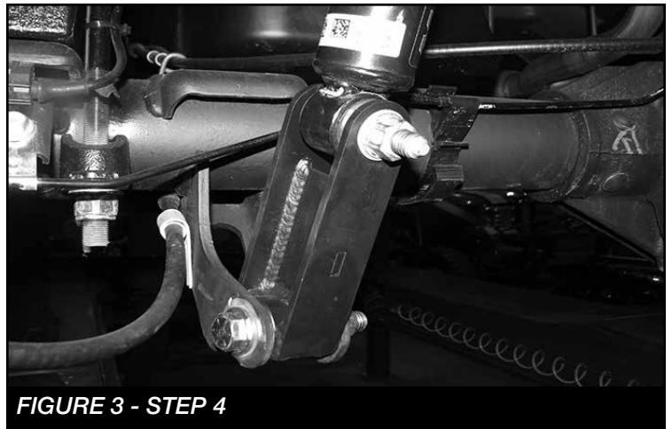
FIGURE 3 - STEP 4