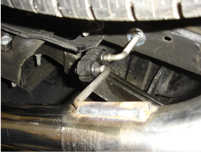
Fig # 1 Passenger Side

Step 3: Once a final position has been chosen for the new system, evenly tighten all fasteners from front to rear. The supplied band clamps must be VERY tight to properly align the pipes and prevent leaks (Approximately 40ft-lbs). U-bolt clamps should be tightened to approximately 30-35ft-lbs. Inspect all fasteners after 25-50 miles of operation and retighten if necessary.