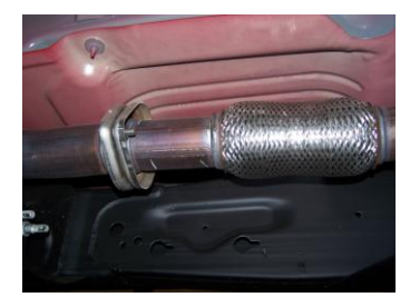
2. To remove stock exhaust, unbolt it at the flange behind the Y-pipe. Make sure to leave all rubber grommets in the factory location. You will re use stock nuts and bolts. For easier removal of exhaust, cut behind the muffler. Use WD-40 to remove hangers from grommets.

1. Disconnect the negative battery cable before removal of OEM exhaust. This will allow the computer to reset and recognize the new exhaust. Lay out the exhaust on the floor so it looks like the drawing and compare parts with manual.