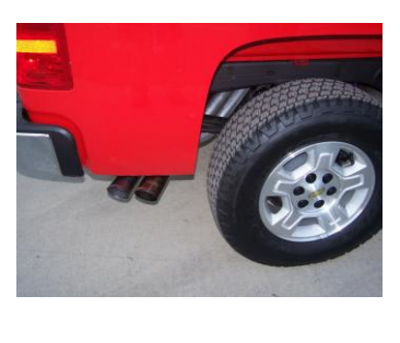
8. Install stainless steel tip. Clamp down. When you have everything in place, firmly tighten all bolts and clamps down securely. Use stainless steel cleaner and a Scotch Brite pad weekly to prevent tip from discoloration. Inspect all fasteners after 25-50 miles of operation and re-tighten as necessary.

GIBSON EXHAUST systems are designed on a factory stock vehicle