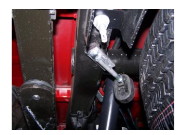
5. Install metal hanger #H into hole located approximately 16" from the rear of the frame. Use hardware kit #I, washer #M, and rubber grommet #J.

8. Install exit pipes #E onto tailpipes. Cut to your preferred length then use clamps to secure exit pipes to tailpipes. Install stainless steel tips. Clamp down. When you have everything in place, firmly tighten all bolts and clamps down securely. Use stainless steel cleaner and a Scotch Brite pad weekly to prevent tip from discoloration. Inspect all fasteners after 25-50 miles of operation and re-tighten as necessary.