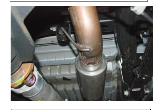
5. Install the over axle pipe Item # C into the muffler outlet. Install hangers into the rubber grommets. You may need to adjust the pipes to allow for proper fitment and clearance. Sometimes these adjustments will be needed at the front head pipes.