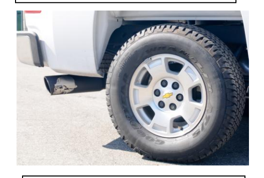
7. Be sure to check all clearance after each section has been tightened to be sure there is proper clearance. It may take 4-500 miles for your vehicle to fully adjust to the changes in exhaust flow.

"MAKE SURE YOU HAVE A 1" CLEARANCE ON ALL PIPES FROM ALL RUBBER BRAKE LINES, SHOCK BOOTS, TIRES, ETC..." TORQUE ALL CLAMPS TO APPROX. 100 TO 150 FT LBS.