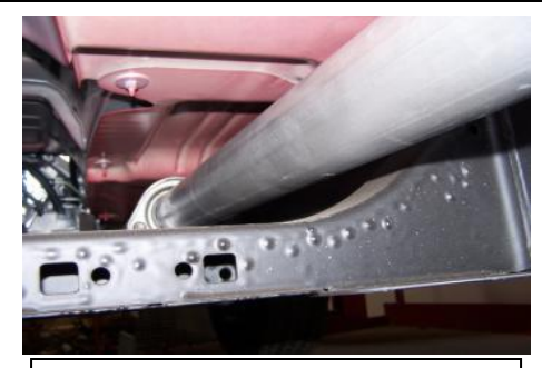
3. Install head pipe Item # A onto the two bolt factory flange. Do not tighten. Insert hanger in to rubber grommet tailpipe.