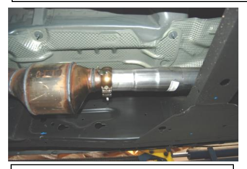
2. Note: 2009 models will not have the 2-bolt flange and will require the adapter Item# G. Measure 8.0" from the flange on head pipe item # A and cut. Attach the adapter to the new head pipe using clamp item # E. loosely tighten down and install

1. Disconnect the negative battery cable before removal of the OEM Exhaust. This will allow the computer to reset and recognize the new exhaust. Lay out the exhaust on the floor so it looks like the drawing and compare parts with manual. Remove the factory exhaust by cutting behind the factory muffler. Once the tail pipe has been removed un-bolt the muffler and head pipe at the flange located behind the catalytic converter. Use wd-40 or another type of penetrating oil to remove the rubber grommets. Do not damage these they will be re used.