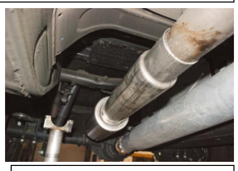
4. Install muffler assembly Item # B onto the head pipe. Use a jack stand to support the muffler while installing the tailpipe. Loosely tighten down the clamp.