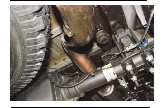
6. With proper clearance from spare tire install the exhaust tip onto the tailpipe. The system was designed to have the tip 1" below the quarter panel of the vehicle. With the tip in your desired position begin to tighten down all clamp connections from the front head pipe back.