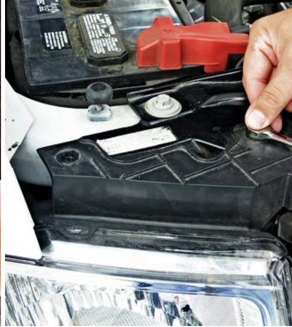
An example of where anchor bolts for many styl assemblies may be located.

Depending upon the year and model of your car, you may need to remove your vehicle's front grille section in order to access bolts or clips that secure the headlight assembly in place. This can be done by removing the screws from the top or sides of the grille and/or by releasing hold-down clips found on some vehicles with a flathead screwdriver.