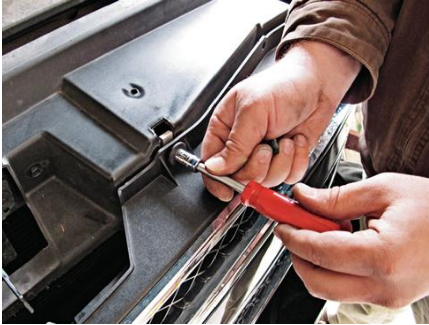
Removal of front grille sections to access headlamp anchor points is required on many vehicles.