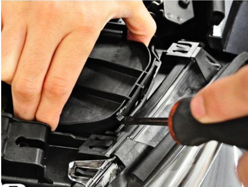
An example of hold-down clips that must be released before a headlamp assembly can be removed.