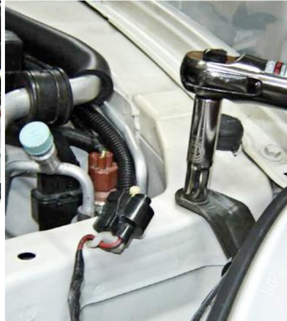
A second example of loosening headlamp assembly anchor bolts.

Once any grille, trim, and bumper cover sections have been removed in order to provide access to headlamp assembly attachment points, you can proceed with unbolting them - usually a small socket wrench serves best for such applications. Look for hold-down bolts in the metal body panels above and to the side of your headlamp assemblies. Some vehicles also feature hold-down clips on the headlamp assembly which can be released with a flathead screwdriver.