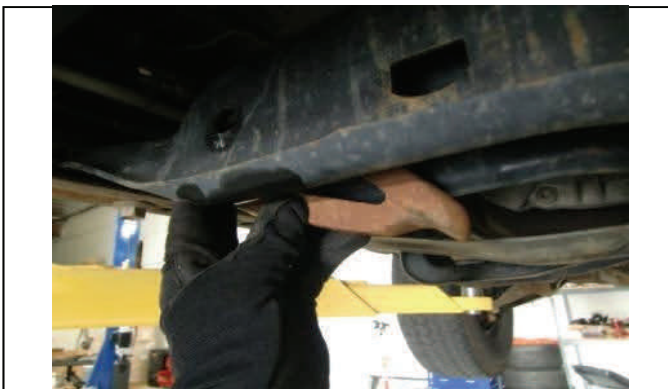
Slide torsion bar forward and remove OE key