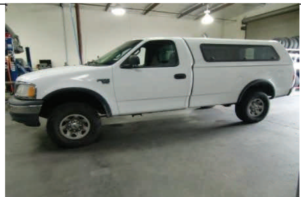
Lower vehicle, reattach shocks and take measurements