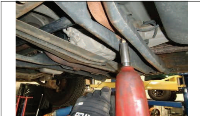
Remove torsion key adjustment bolt