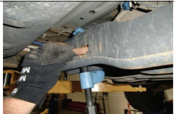
Use torsion key unloading tool to remove adjustment block