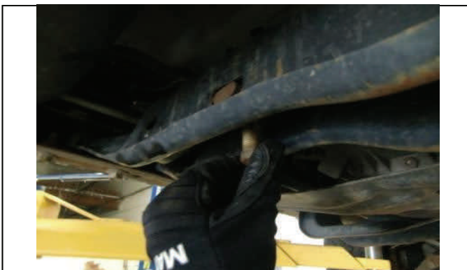
Reinstall adjustment bolt by hand to snug, initial setting