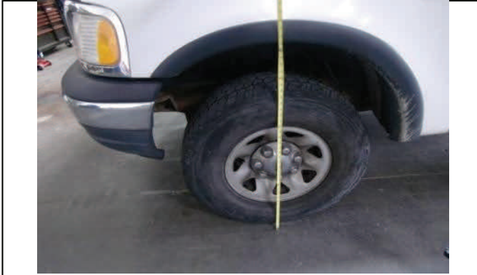
Place vehicle on level surface and take measurement