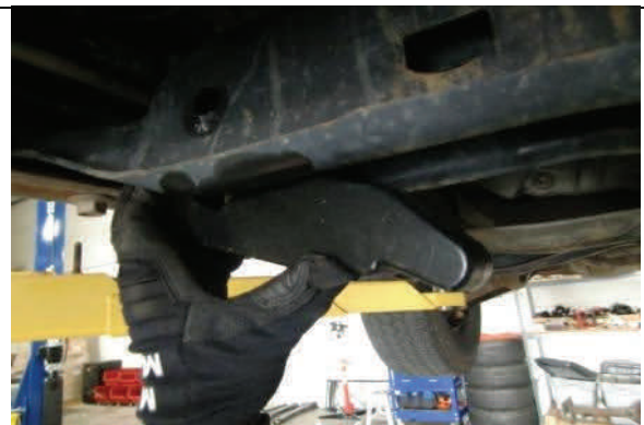
Install new key, reposition torsion bar and reinstall adj. block