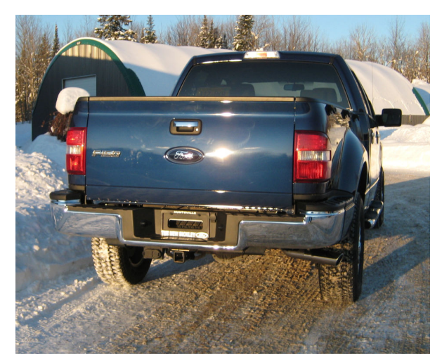
Congratulations! You are ready to begin experiencing the improved power, sound and driving excitement of your MBRP Inc. performance exhaust system. We know you will enjoy your purchase.