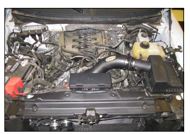
11. Double check your work! Make sure there is no foreign material in the intake path. Make sure all clamps, hoses, bolts, and screws are tight. Double check the hood clearance! Reconnect the negative battery cable!

Thank you for purchasing the Airaid Intake System. Contact Airaid @ (800) 498-6951 8:00 AM - 5:00 PM MST weekdays for questions regarding fit or instructions that are not clear to you. Your Airaid Intake System was carefully inspected and packaged. Check that no parts are missing, or were damaged during shipping. If any parts are missing, contact Airaid. The air filter element is protected from direct exposure to water and debris; care should be taken not to drive through deep water. WA-TER INGESTION IS THE DRIVERS RESPONSIBILITY! The air filter is reusable and should be cleaned periodically.