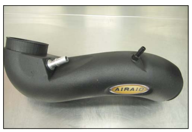
6. A.) Install the 3/8 "Barbed Fitting (#5) into the