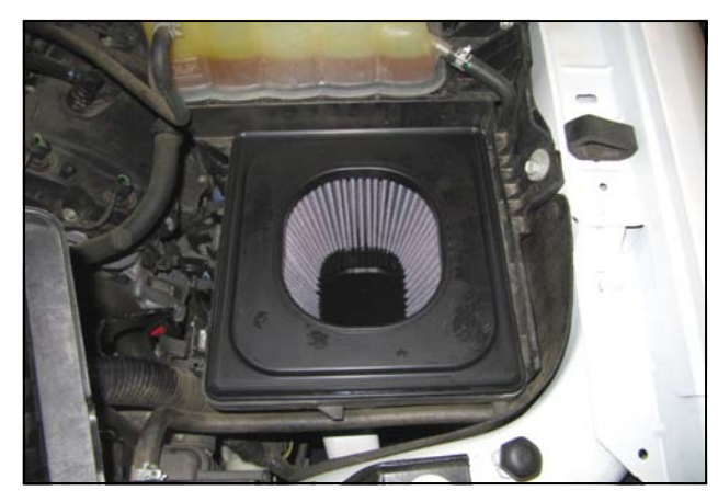
4. Install The Airaid Premium Filter (#1) into the air-