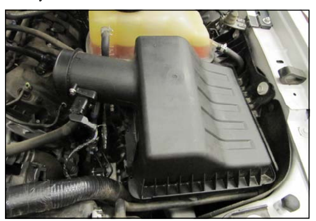
5. Reinstall the airbox upper half.

B. Loosen the two intake clamps, and remove the factory intake tube.