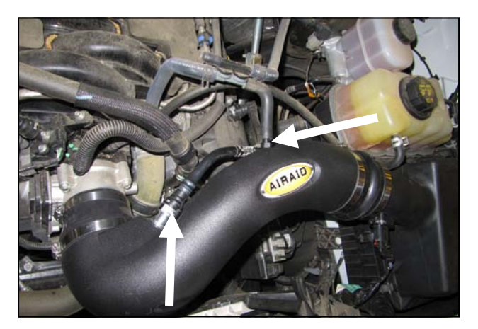
10. Reconnect the breather lines to the Airaid Intake Tube.