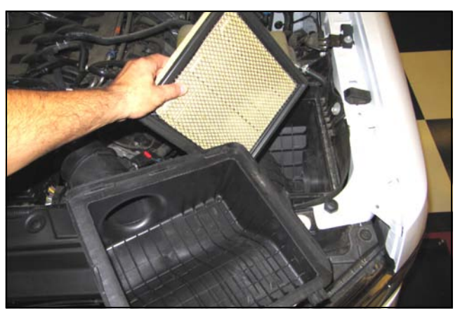
3. If installing the Airaid Jr. Kit, unfasten the three clips on the left side of the factory airbox, and remove the upper half of the factory airbox. Remove the factory air filter element.