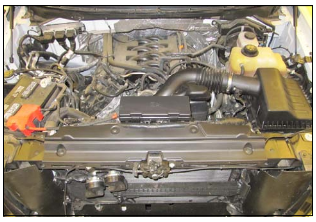
1. Disconnect The Negative Battery Terminal!

Full color instructions can be viewed on our web site at Airaid.com. If you need any assistance please call 1-800-858-3333 to speak with a representative in our Customer Service Center before returning the product.