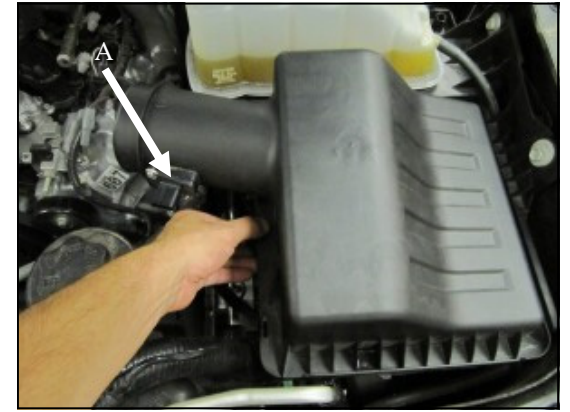
2. A.) Disconnect the Mass Air Flow (MAF) Sensor.

B. ) Unfasten the three airbox clips on the left side, and remove the upper half of the factory airbox.