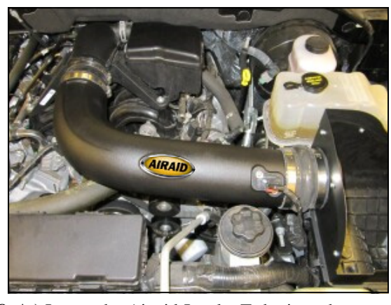
8. A. ) Insert the Airaid Intake Tube into the couplers as shown. Check for alignment, and tighten all clamps.

B. ) Re connect the Mass Air Flow Sensor. Apply the Airaid Bubble Decal onto the Intake Tube as shown.