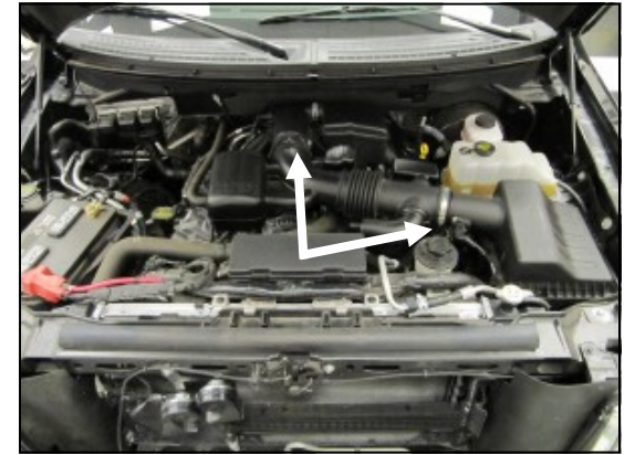
1. Disconnect the negative battery cable! Loosen the two intake clamps and remove the Factory intake tube.