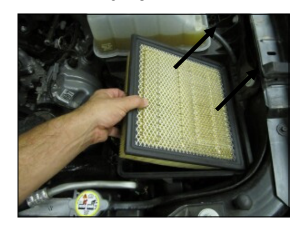
3. Remove the factory air filter from the lower half of the airbox.

B. ) Install the assembly onto the lower half of the factory airbox. Slide the metal tabs into the airbox slots, and fasted the 3 airbox clips.