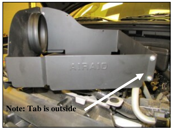
4. Assemble the two Quick Fit panels (#3 & #4) as shown using four 6-32 screws (#9) flat washers (#11) and kep nuts (#10).