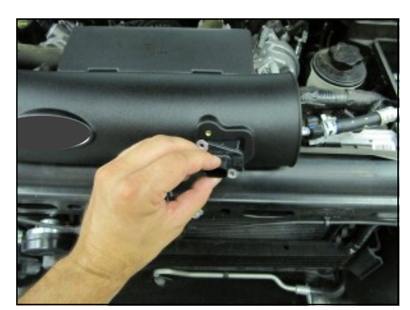
7. Transfer the MAF sensor into the Airaid Intake Tube (#2) and secure using two 8-32 x 3/8" button head screws (#11). Do Not Use The Factory Torx Head Screws!