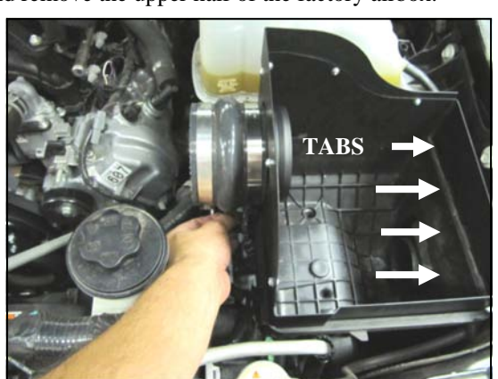
5. A. ) Install the Silicone Hump Hose (#7) and two #64 Hose Clamps(#14) onto the Quick Fit assembly. Leave the clamps loose for now.

B. ) Unfasten the three airbox clips on the left side, and remove the upper half of the factory airbox.