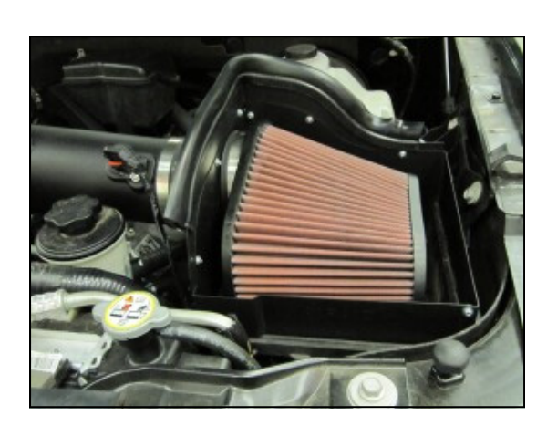
9. Install the Airaid Premium Filter (#1) to the mounting flange inside the quick fit assembly. Complete the installation by attaching the Weather Strip (#5) to the top of the panels as shown.

B. ) Re connect the Mass Air Flow Sensor. Apply the Airaid Bubble Decal onto the Intake Tube as shown.