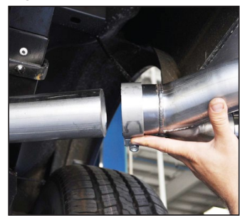
FIG. Z INS5213 8/18/11