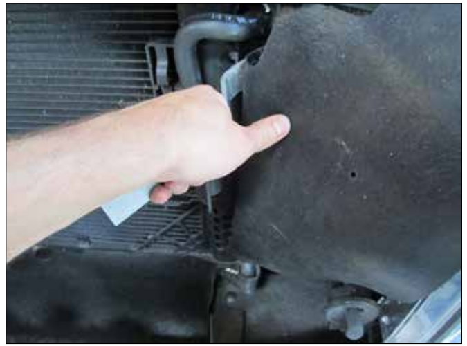
b. Remove two clips securing the shield to the radiator mount.