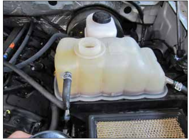
l. Remove the coolant cap.