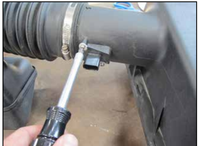
j. Remove the MAF sensor and set it aside for future use.