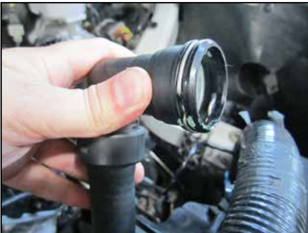
u. Reinstall the clip on the coolant hose fitting.