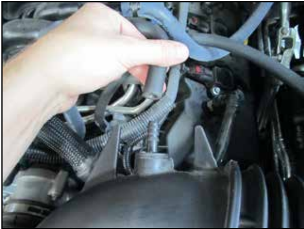
g. Unplug the brake booster hose.