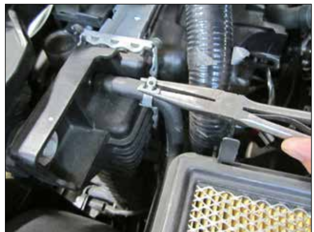
p. Remove one clamp from the radiator overflow.