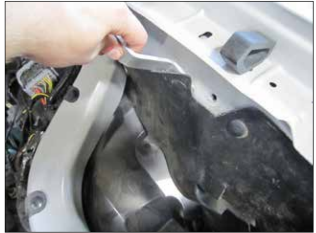
v. Remove six clips and remove the rubber inner fender liner.