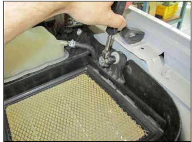
n. Remove the two bolts securing the stock lower air box.