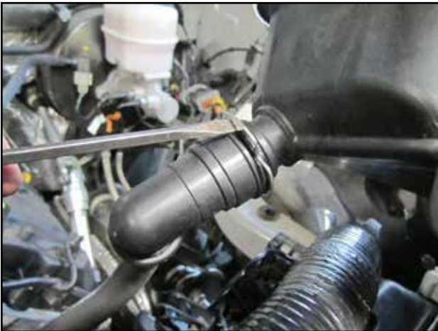
s. Remove the clip from the lower coolant hose fitting.