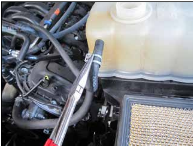
o. Remove one clamp from the coolant reservoir.