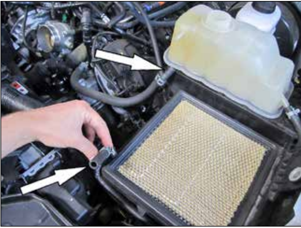
q. Remove one hose from the reservoir, and disconnect the other hose from the radiator.