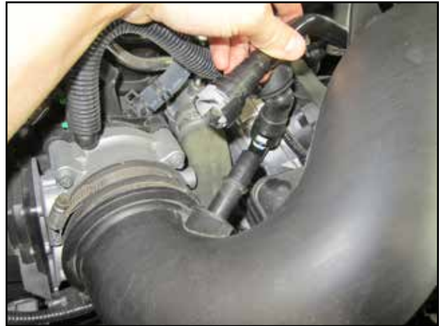
h. Unplug the crank case vent hose.