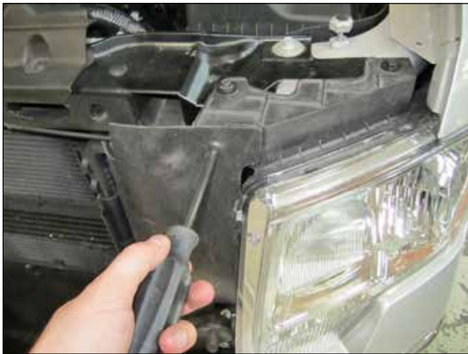
a. Remove the clip securing the shield to the headlight.