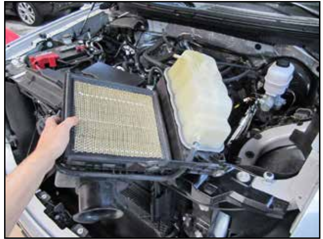
r. Lift the stock coolant reservoir and air box.