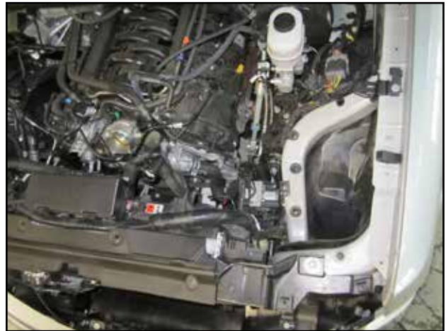
t. Disconnect the coolant hose and remove the stock coolant reservoir and lower air box.