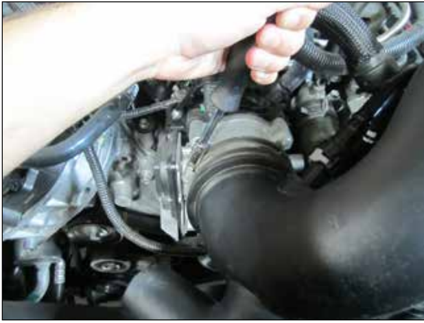
e. Loosen the clamp at the throttle body.