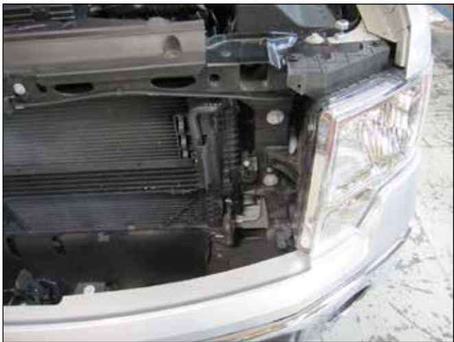
c. Remove the shield.