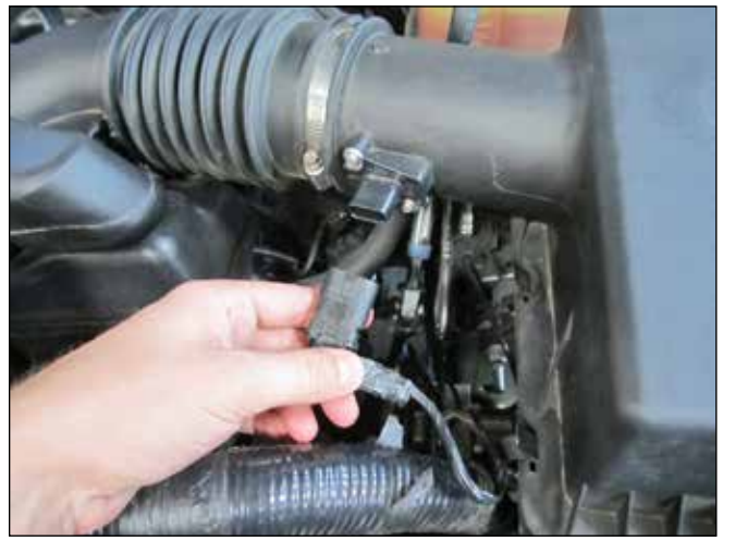
d. Unplug the MAF sensor.