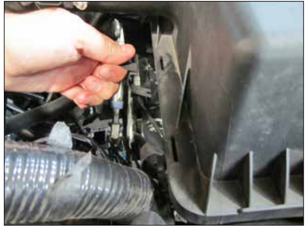
f. Disconnect the clips holding the air box together.