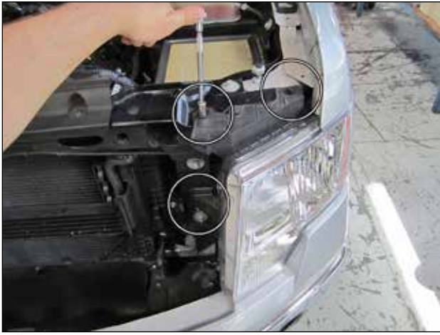
k. Remove the three bolts securing the left headlight.