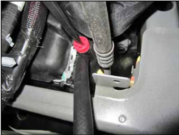
m. Drain 1.5-2 gal of coolant from the drain at the lower right corner of the radiator. Use the supplied 3/8" hose to route the coolant into a clean container to be added back into the system. Remove the hose when done draining, and keep it to be used later.