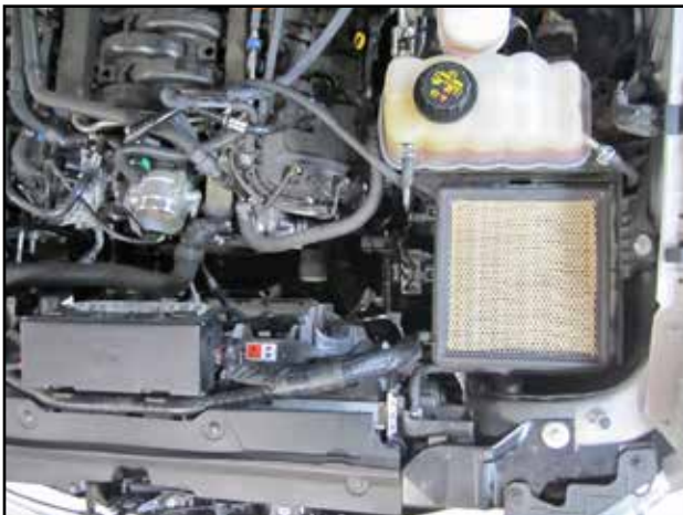
i. Remove the stock intake tube and air box lid.